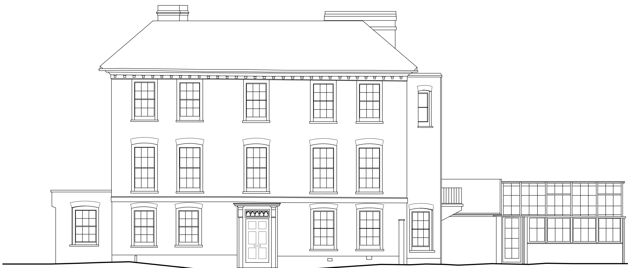
South Elevation (front)