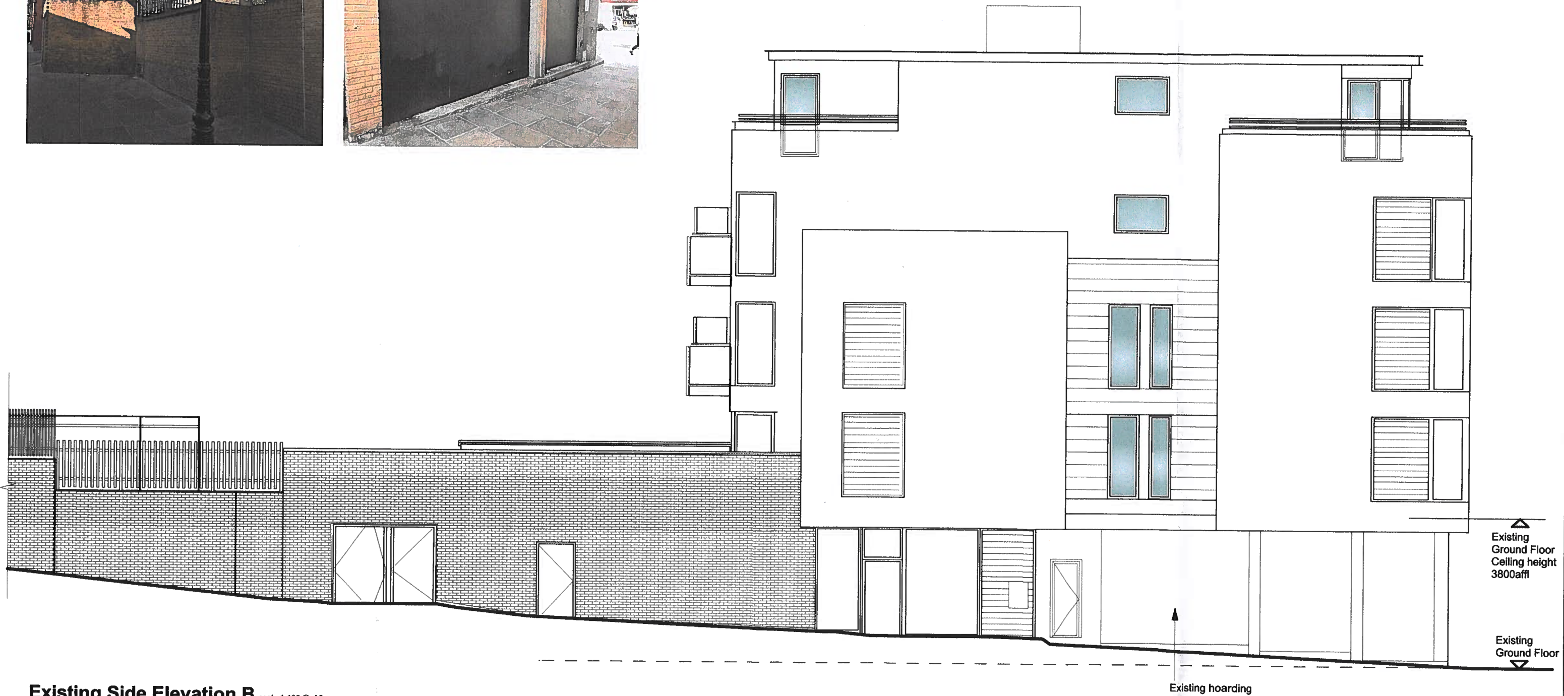
Existing Side Elevation B scale 1:100 @ A3