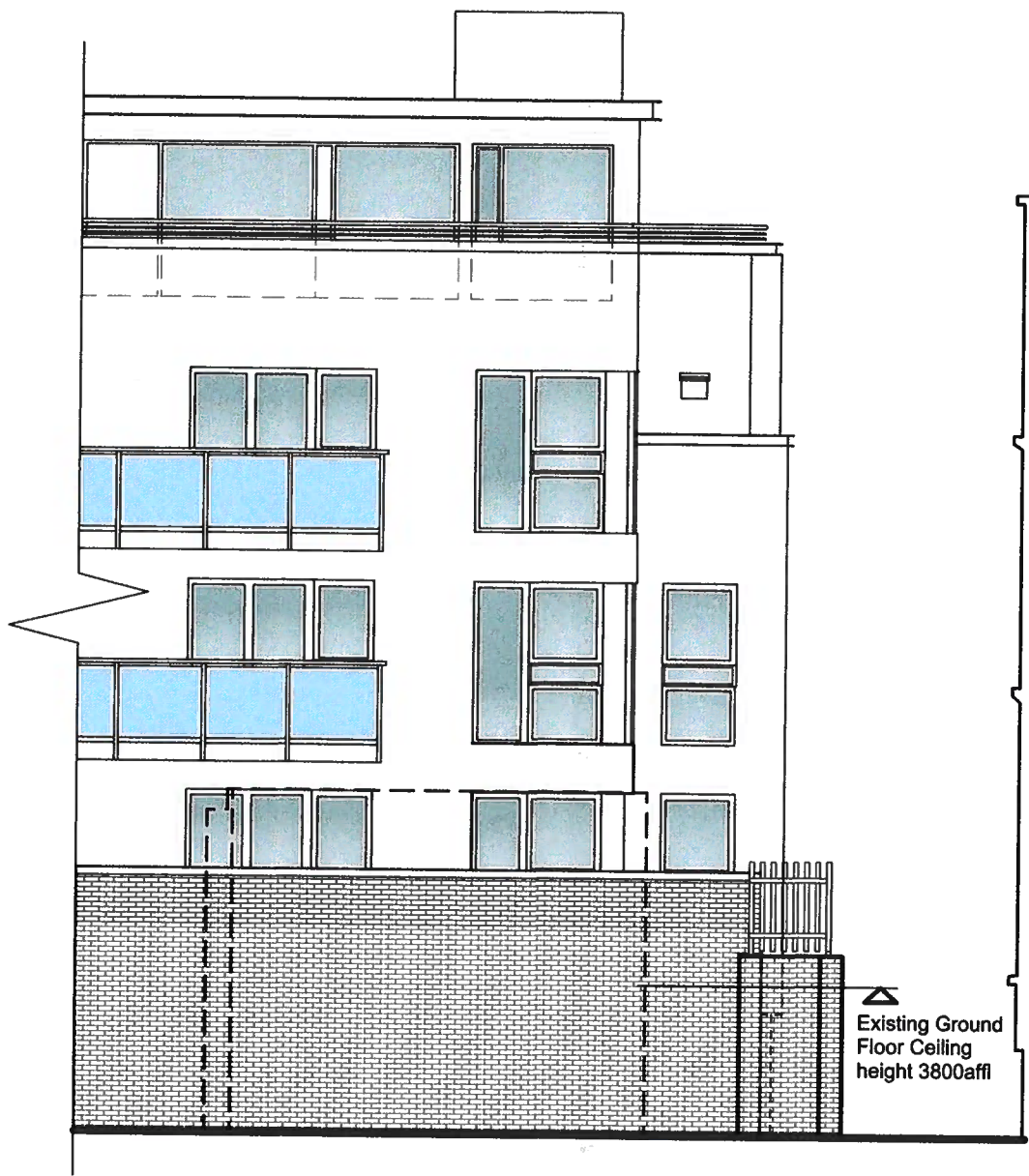
Existing Rear Elevation C scale 1:100 @ A3

Existing Ground Floor Ceiling height 3800affl