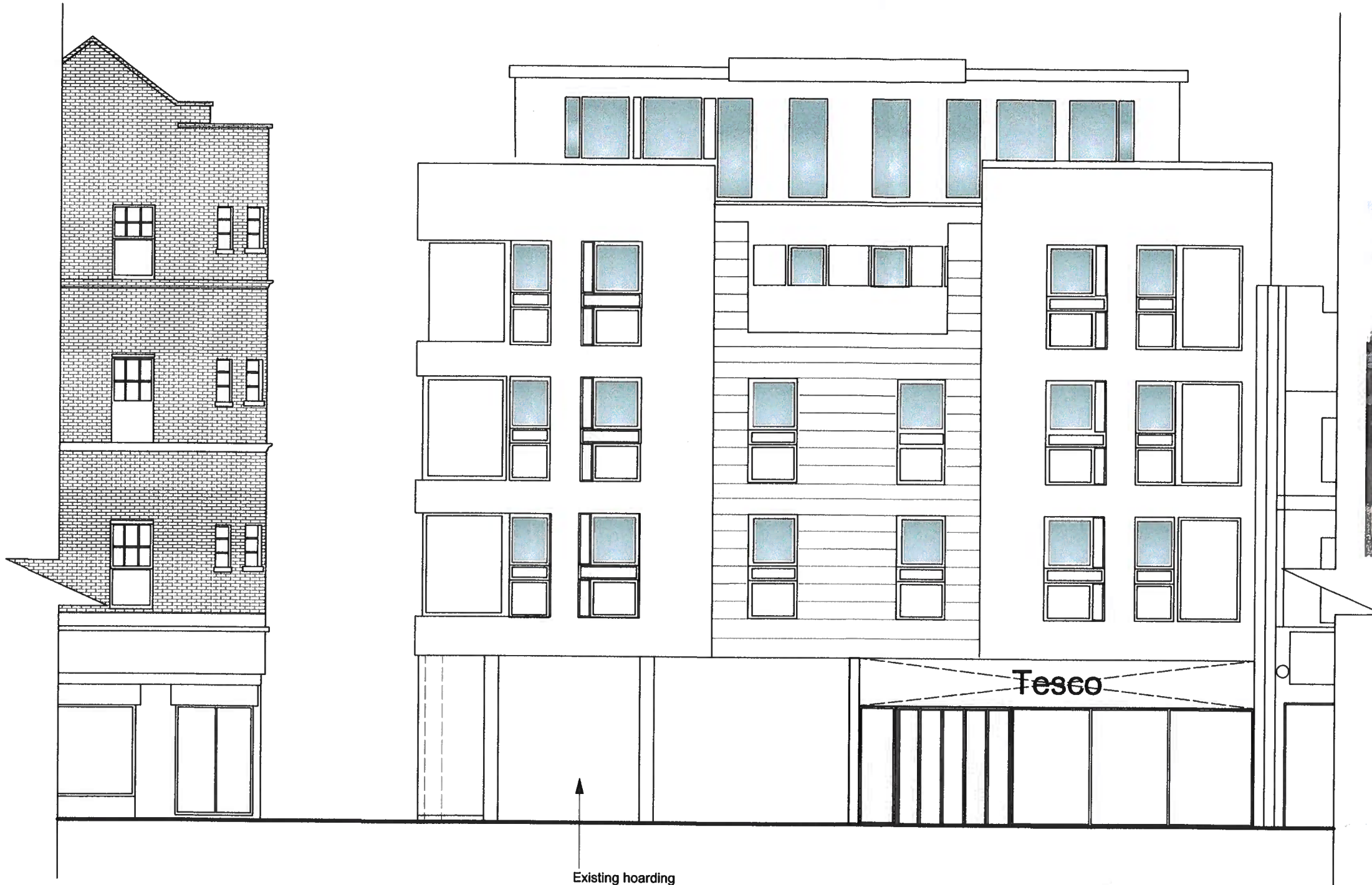
Existing Front Elevation A scale 1:100 @ A3