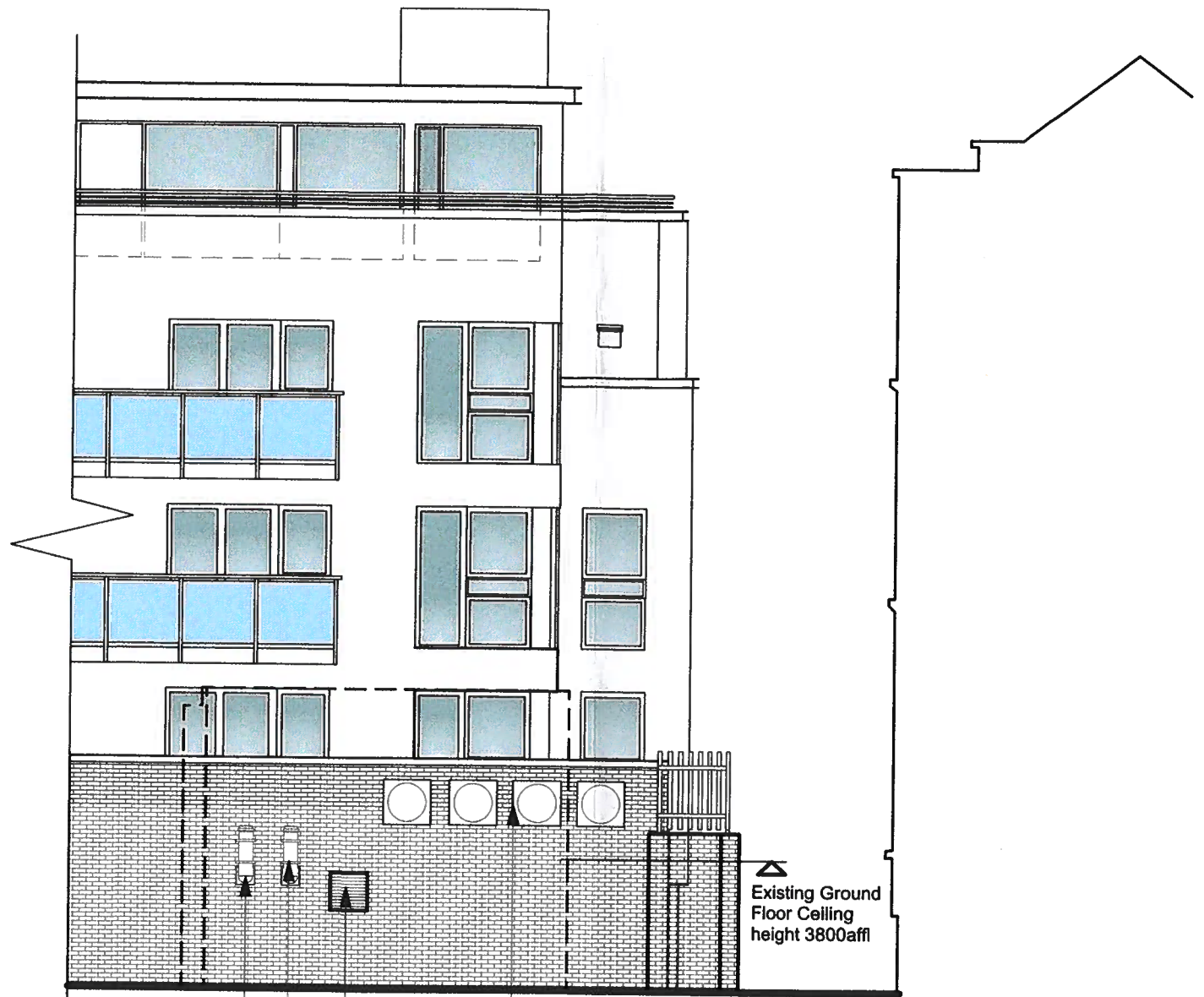
Proposed Rear Elevation C scale 1:100 @ A3

Flu for Gas fired pizza oven. Flu for 1no. x Combi Oven (electric). Ventilation duct Clean air out. 3no. condensing units for AC. 1no for walk in fridge. Existing Ground Floor