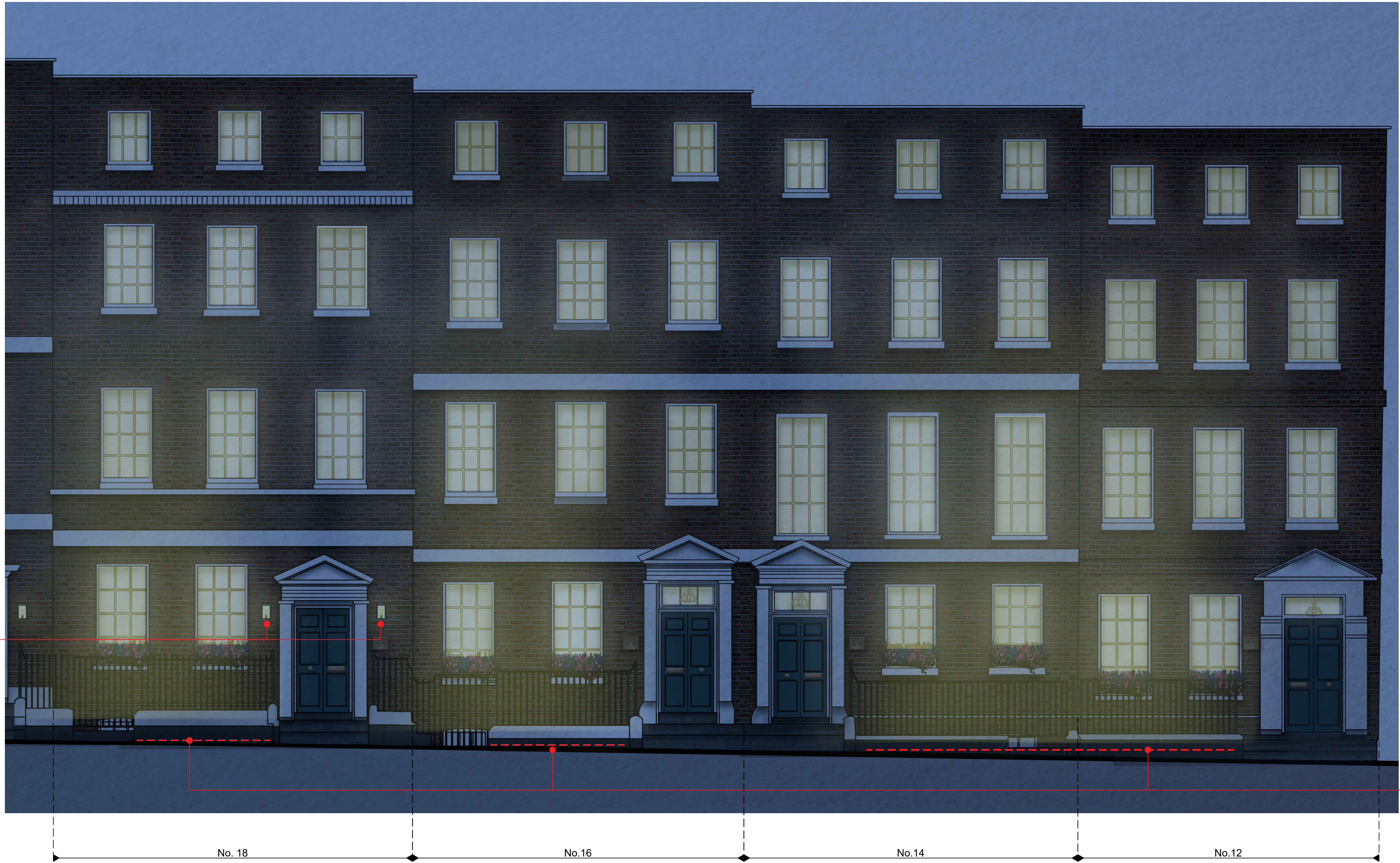
01 Proposed Front Elevation - Theobalds Road (No.12-18)

Number 017-TWA-XX-XX-DR-AR-17020 Revision -