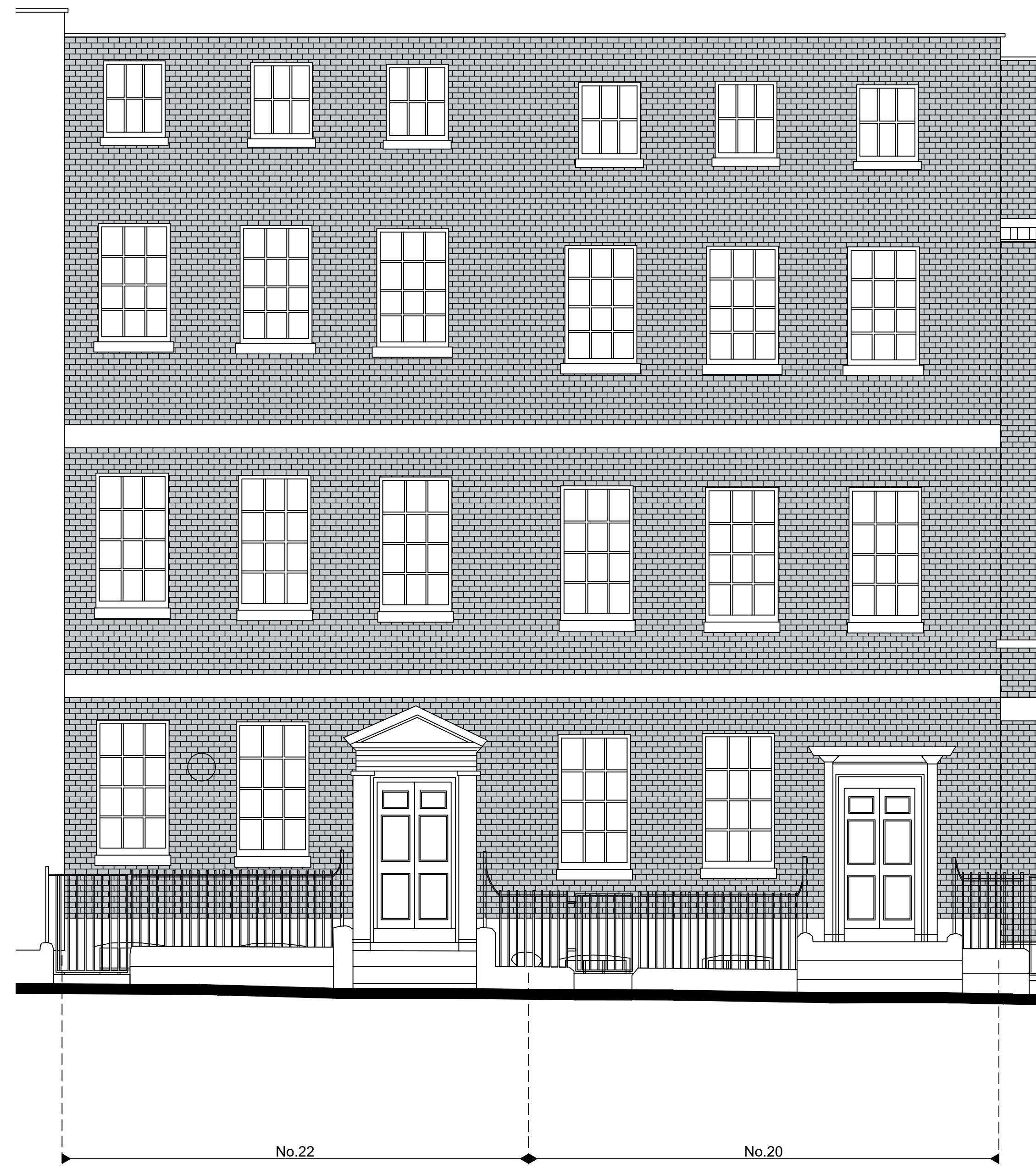
01 Existing Front Elevation -Theobalds Road (No.20-22)