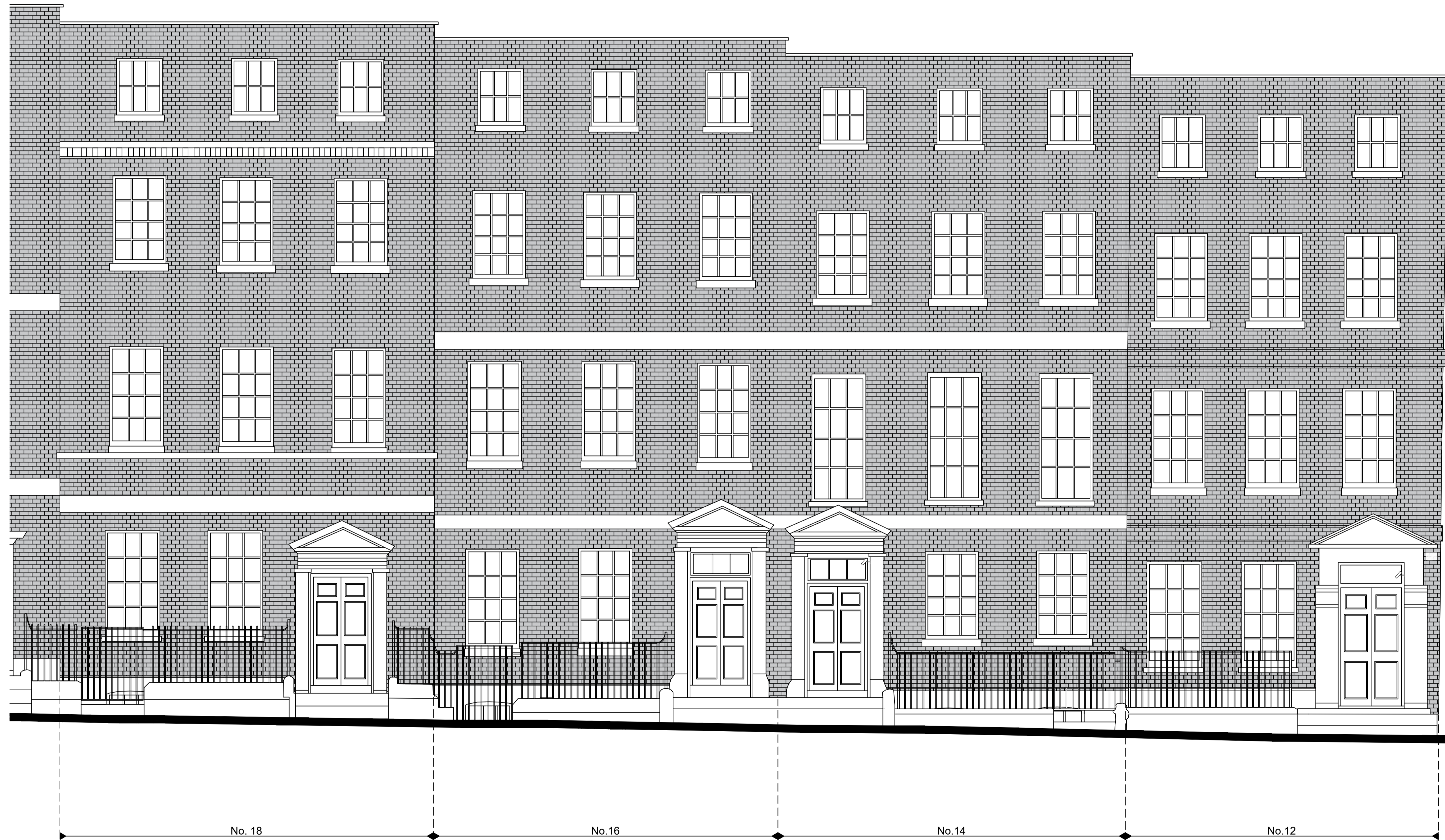
01 Existing Front Elevation - Theobalds Road (No.12-18)