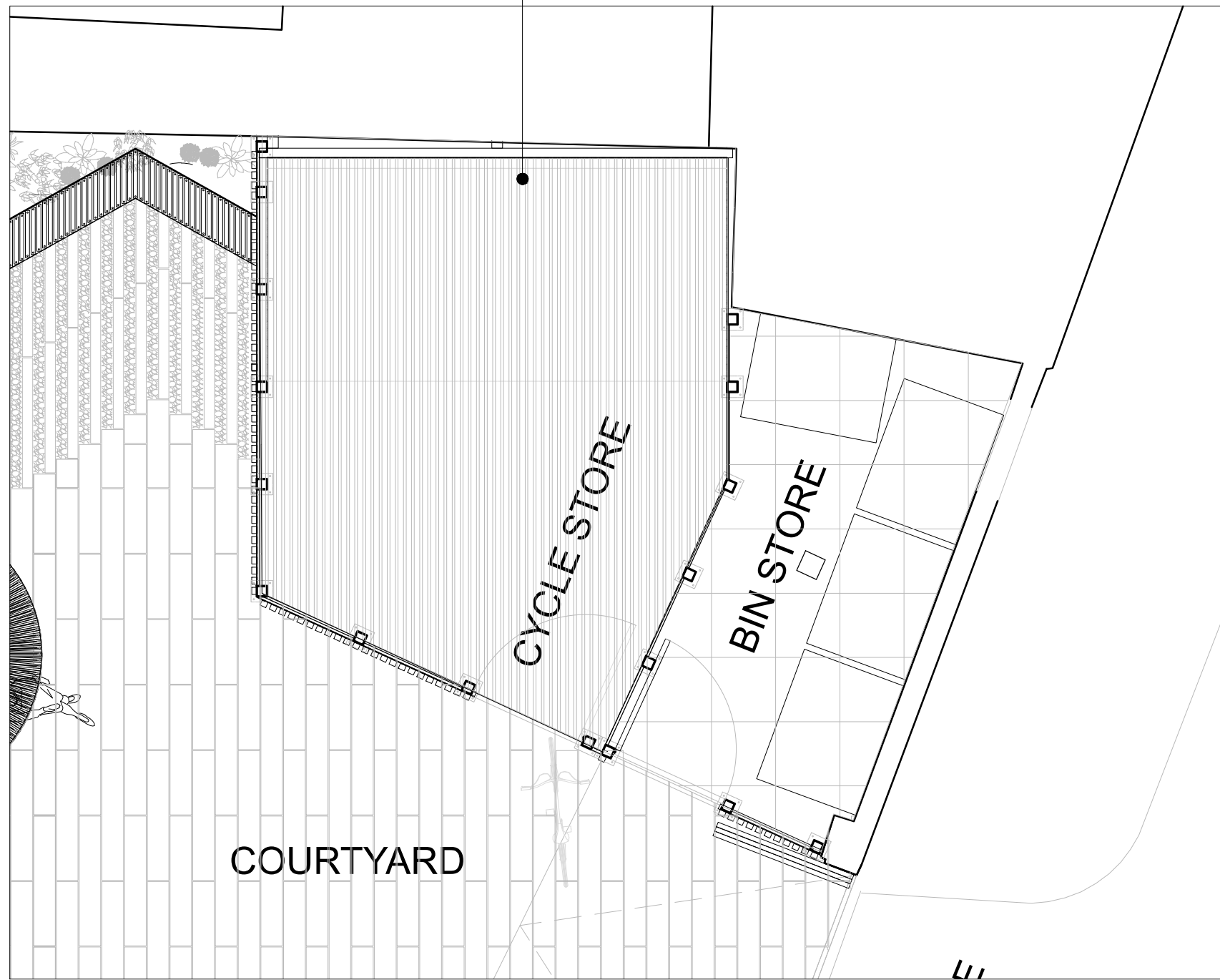
3 PROPOSED CYCLE STORE ROOF PLAN 1:50@ A1