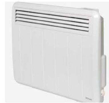
TEA POINT HEATER

Existing half glazed hardwood timber door and frame retained and French polished.