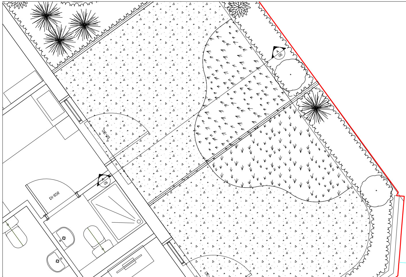
Plan 1:50 @A3