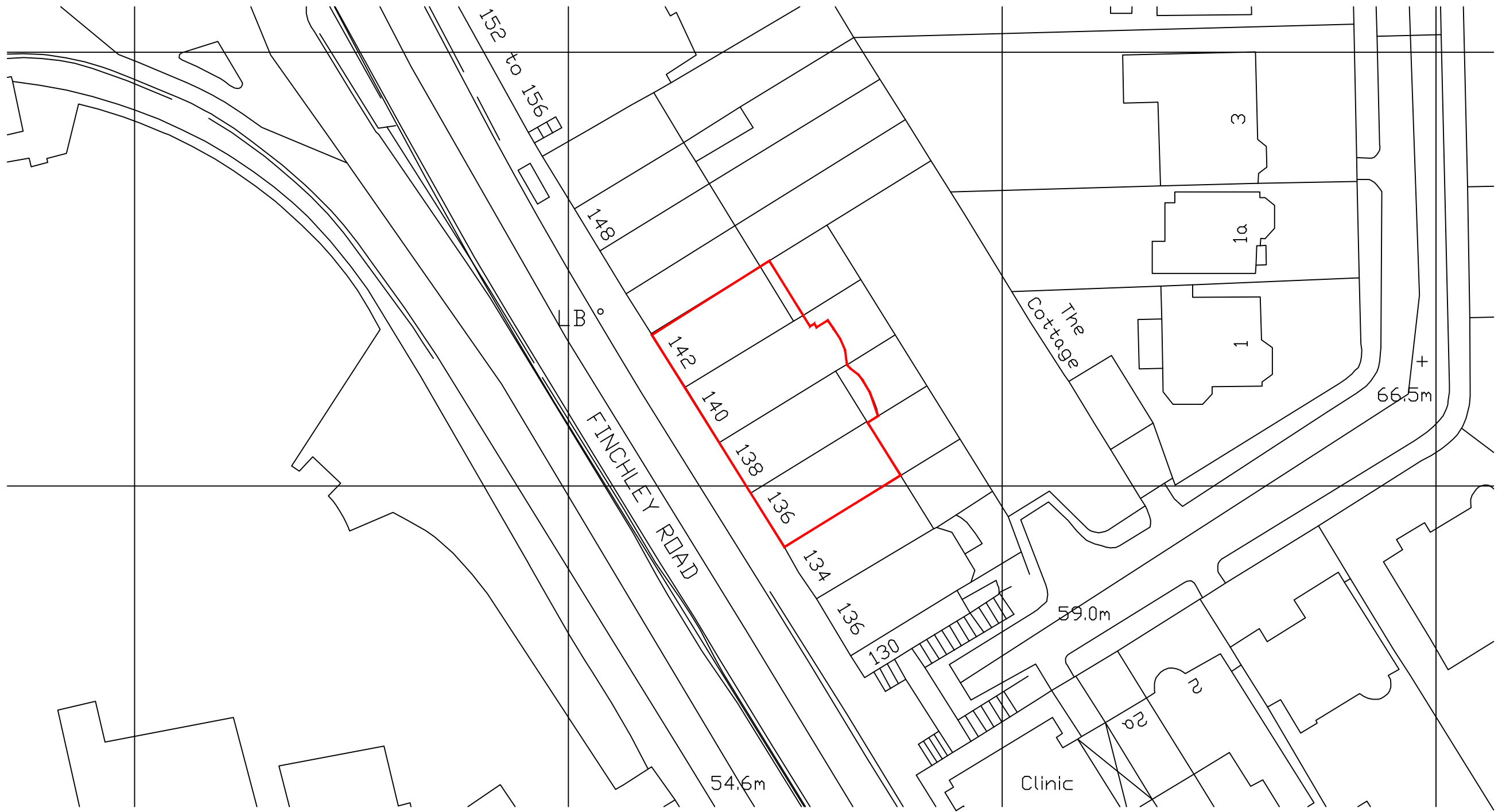
Block Plan (Scale 1:500 @ A3)