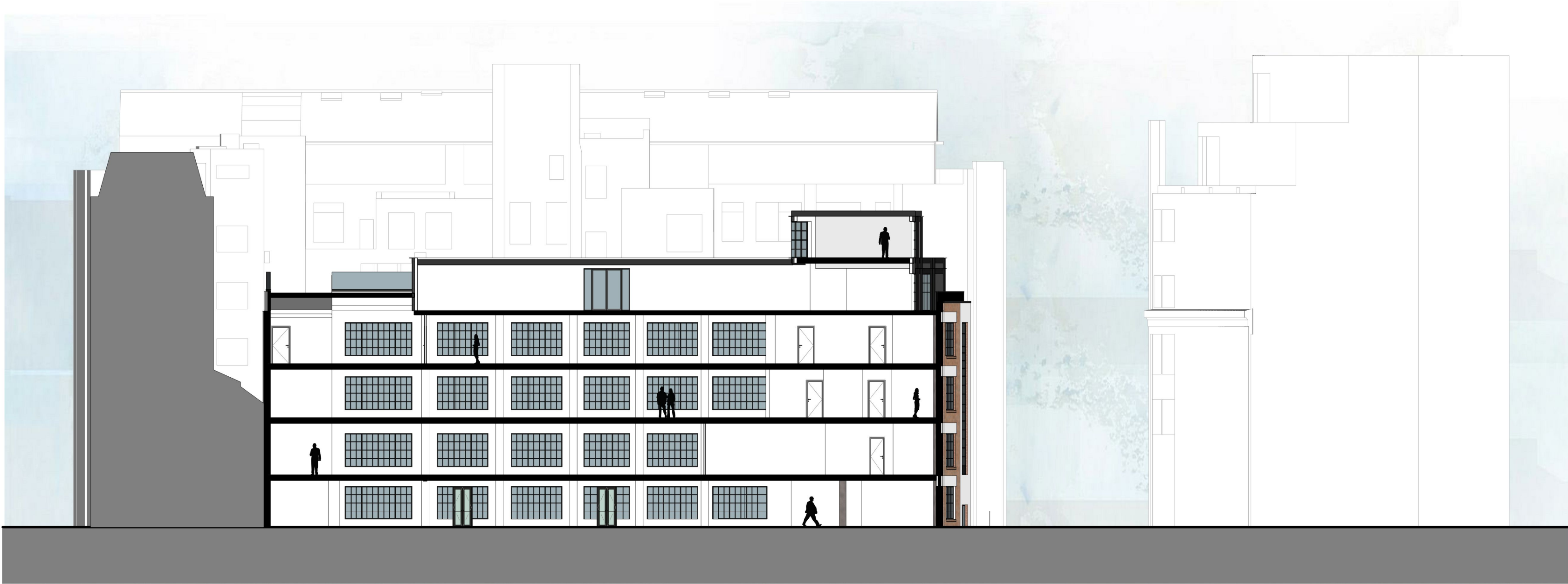
3 Existing Section CC Copy 1 1 : 200