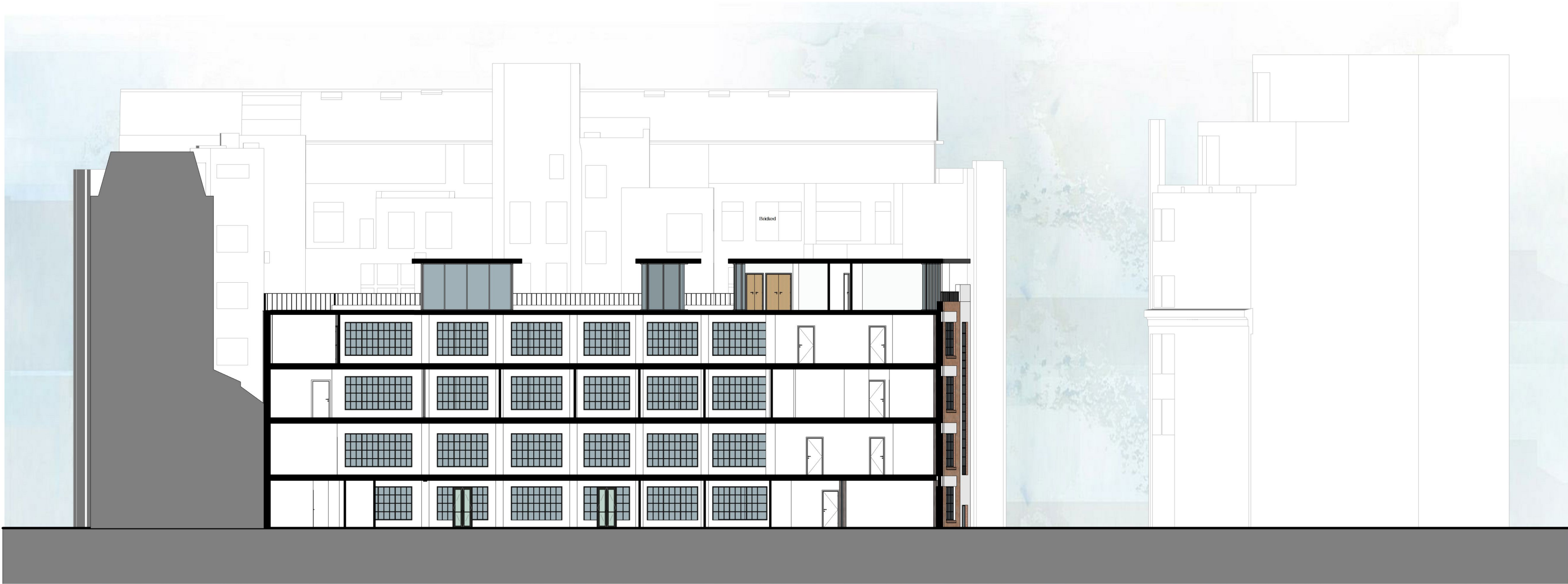
2 Existing Section CC 1 : 200