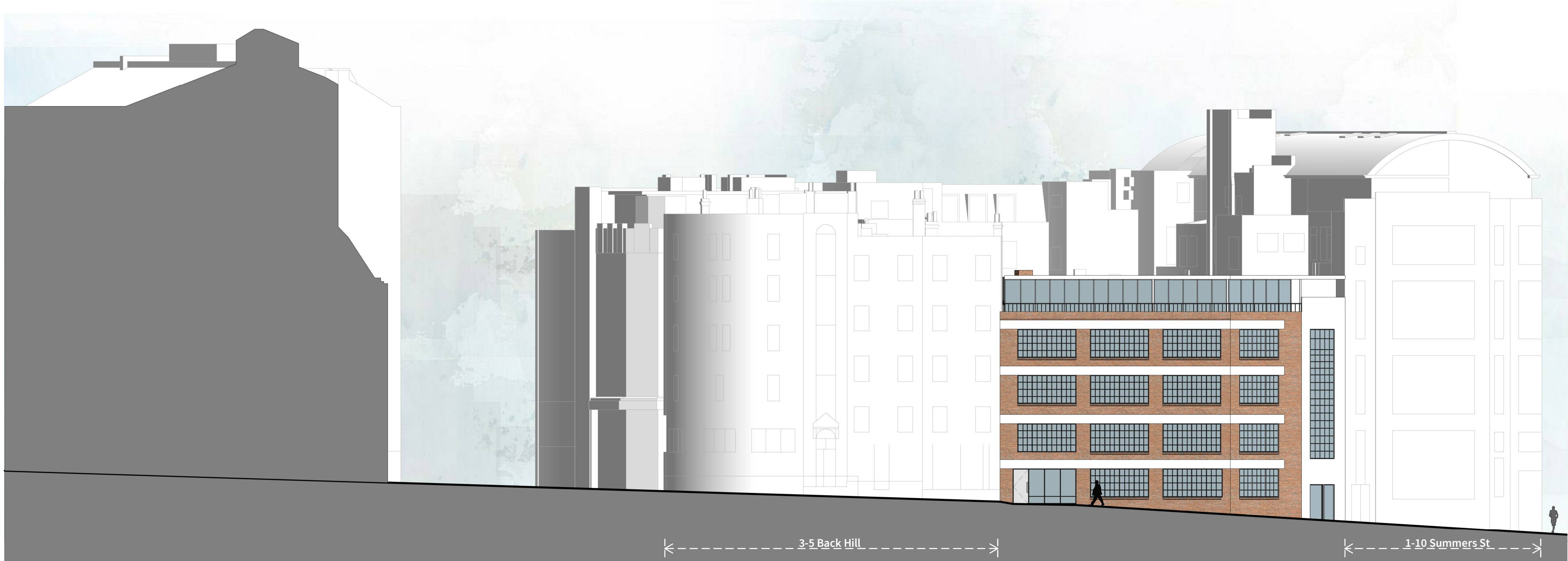
1 Existing Section AA 1:200