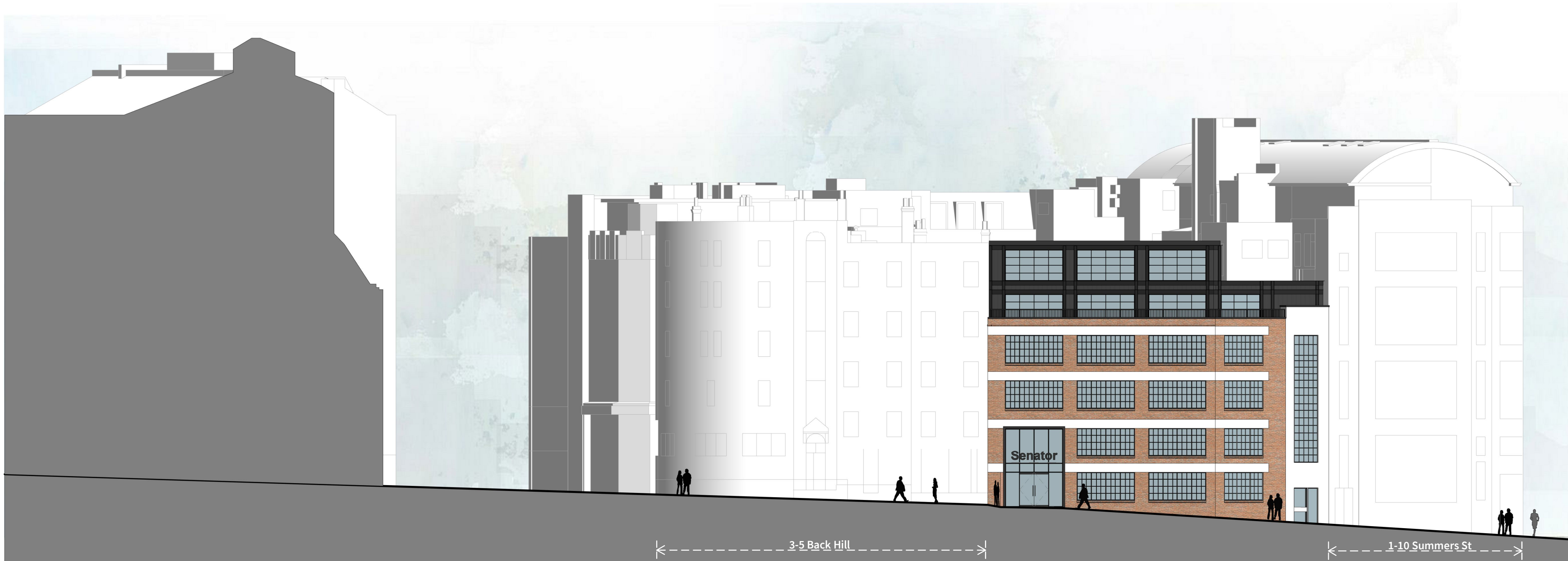
2 Proposed Section AA 1:200