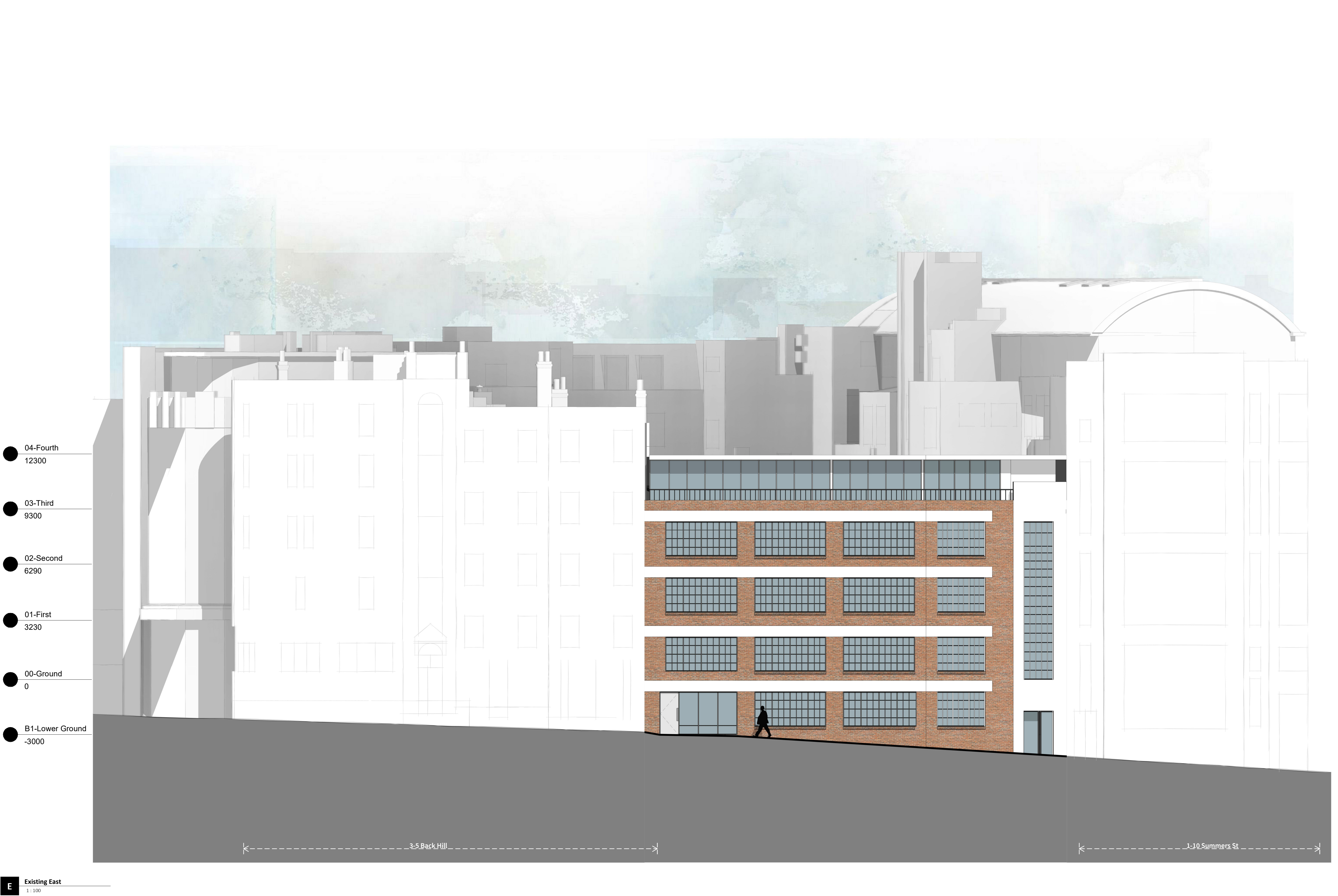
E Existing East 1:100