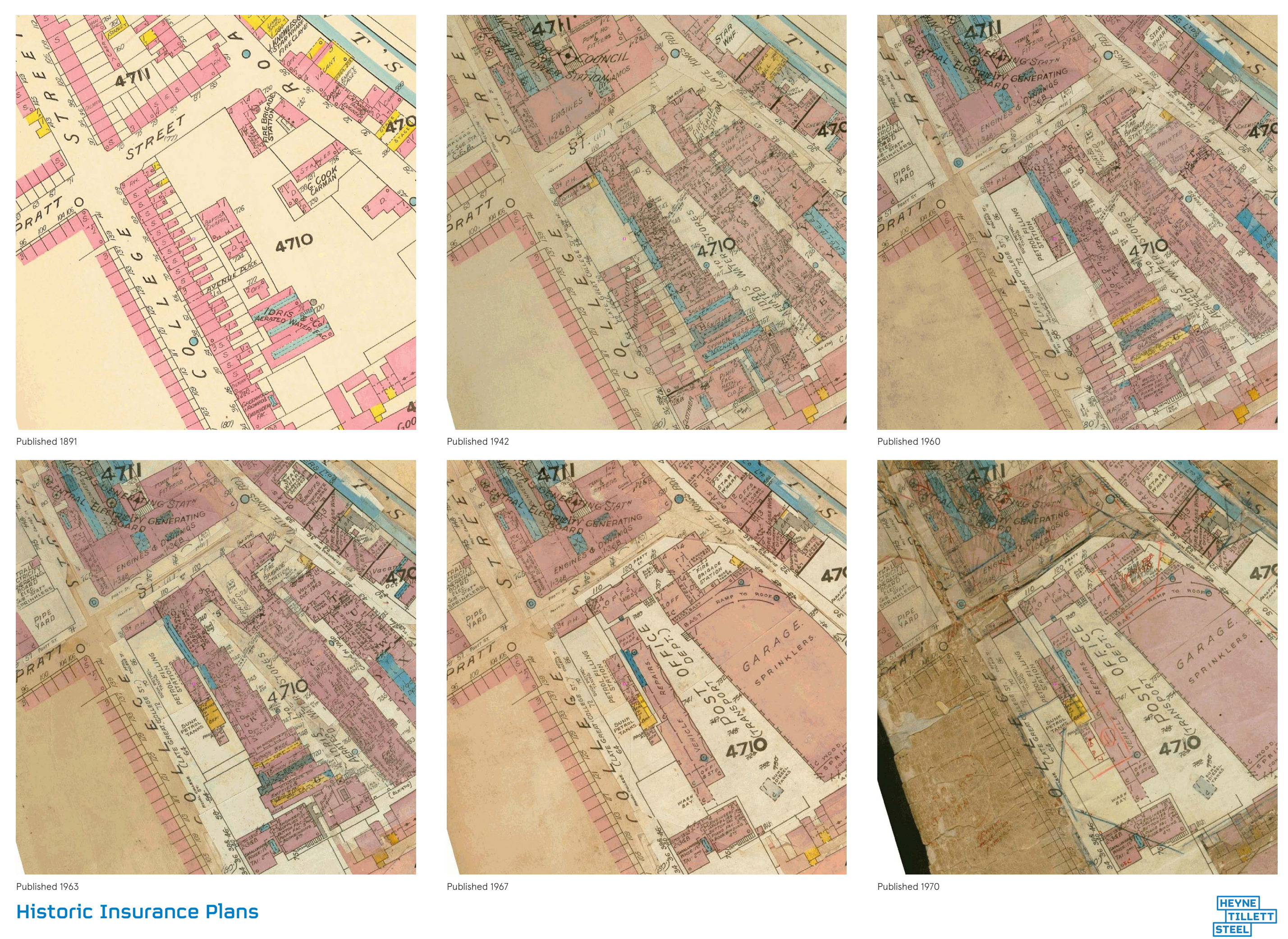
Historic Insurance Plans