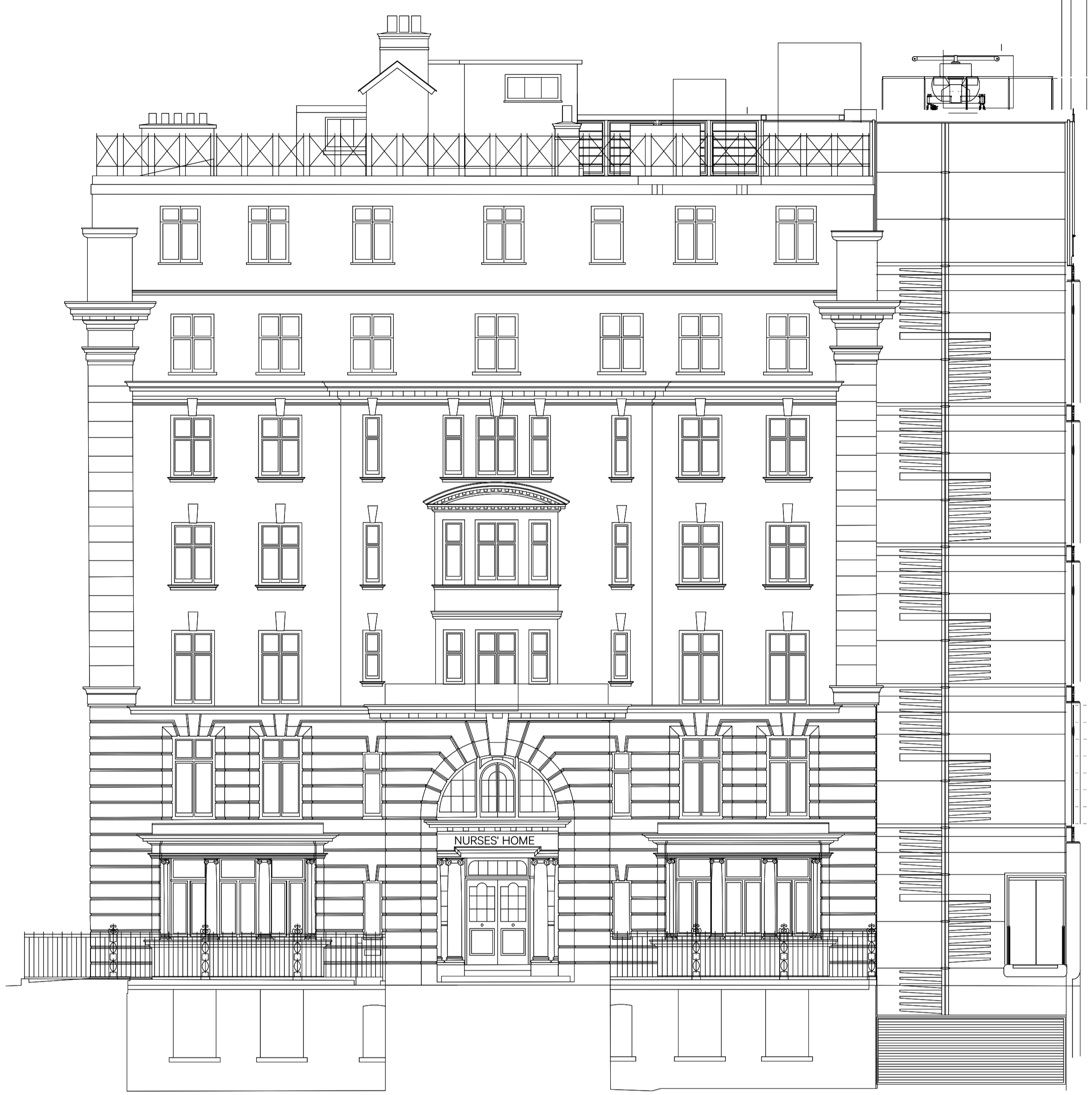
E4 Existing Huntley Street Elevation 1:100 @ A1