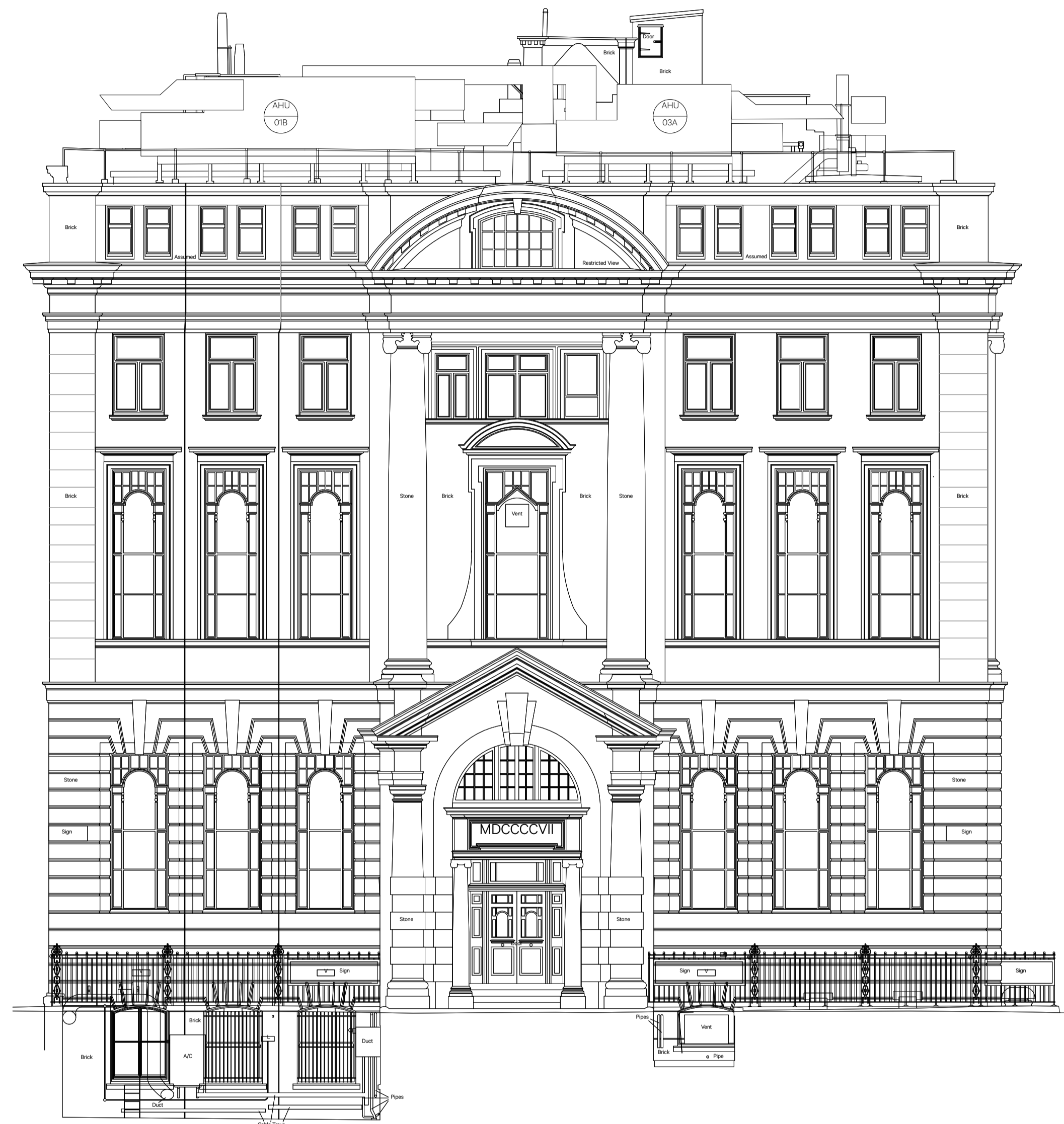
E1 Existing Gower Street Elevation 1:100 @ A1