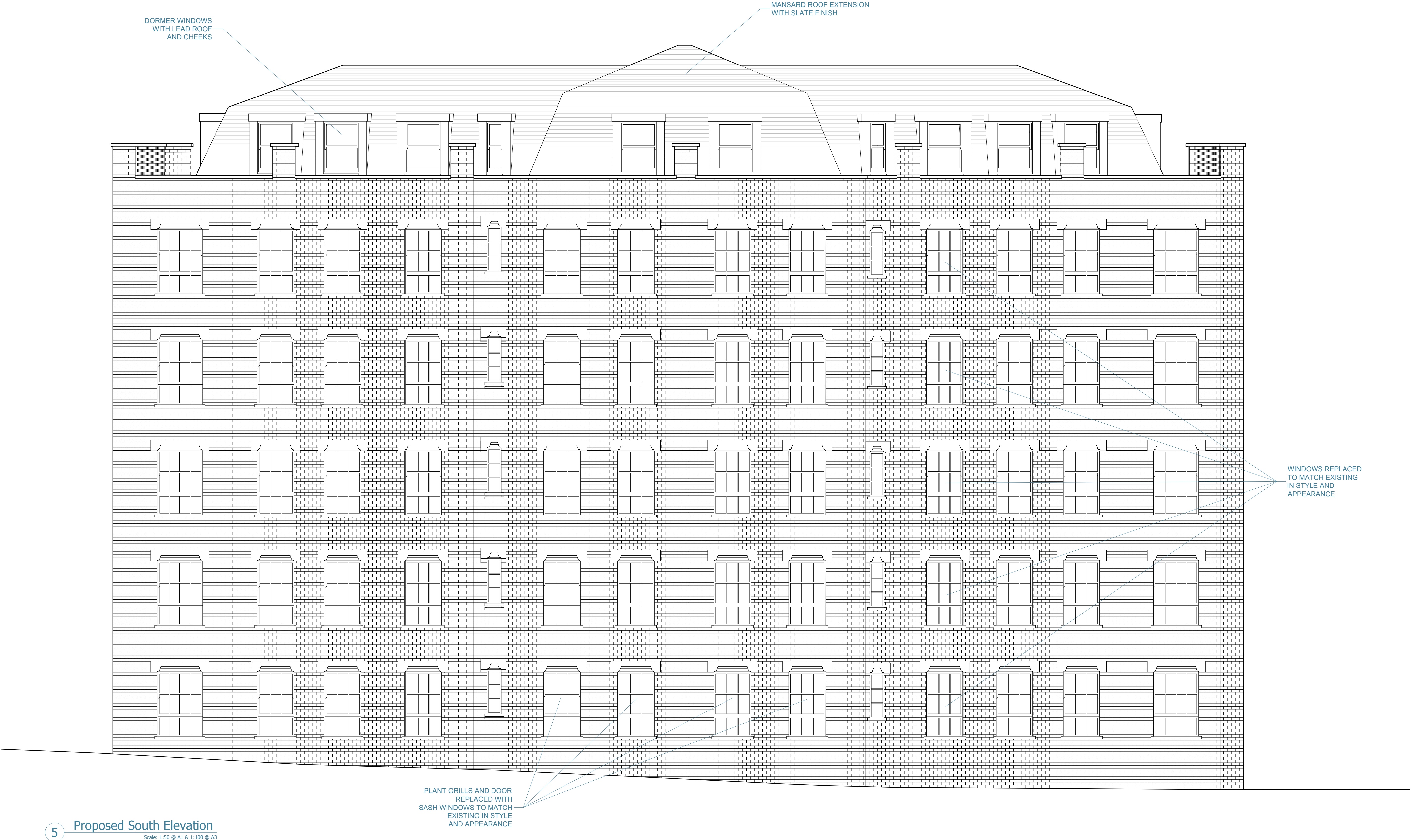
5 Proposed South Elevation Scale: 1:50 @ A1 & 1:100 @ A3

Notes: Copyright of this drawing and the contents remain with Pennington Phillips Limited. Do not scale from the drawings. The contractor is to verify dimensions on site prior to the commencement of work. Any discrepancies are to be reported to the designer. If in doubt - seek clarification.