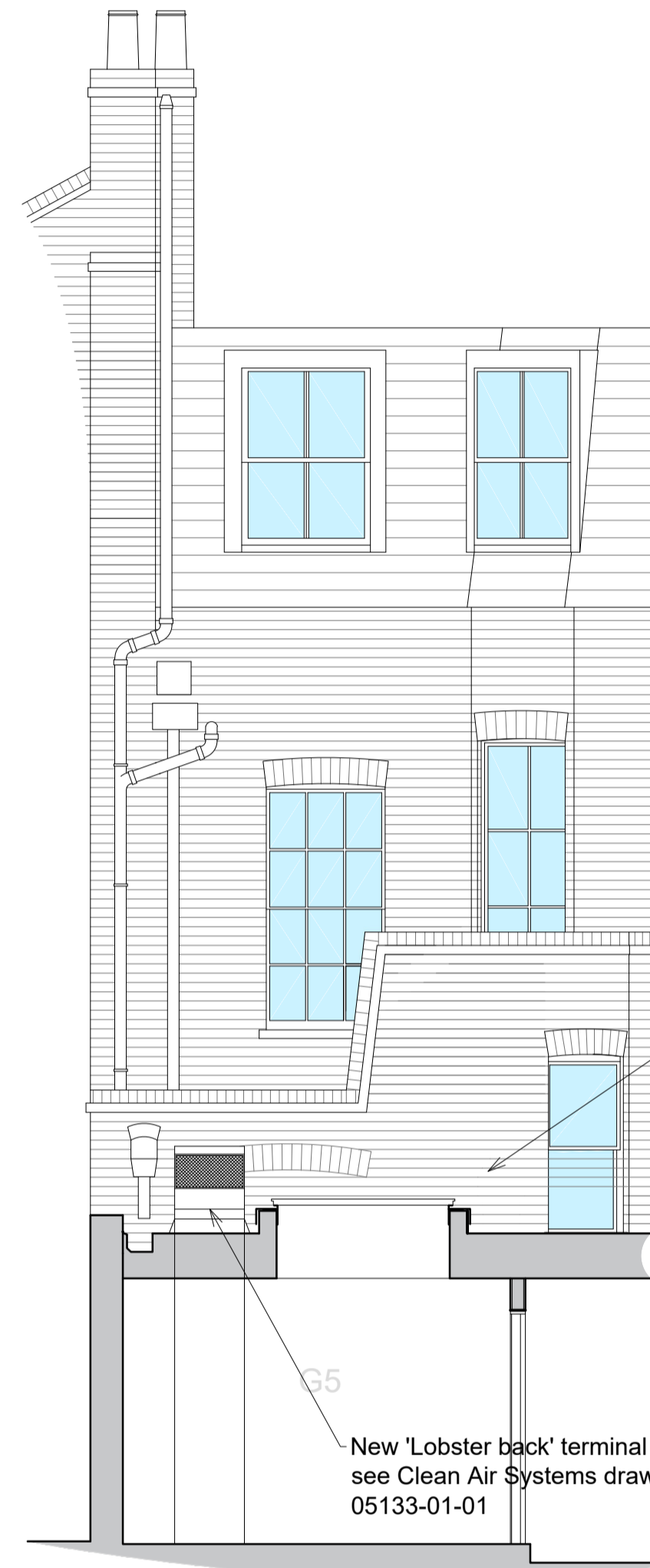
Part Rear Elevation

Existing air extraction pump removed and roof made good