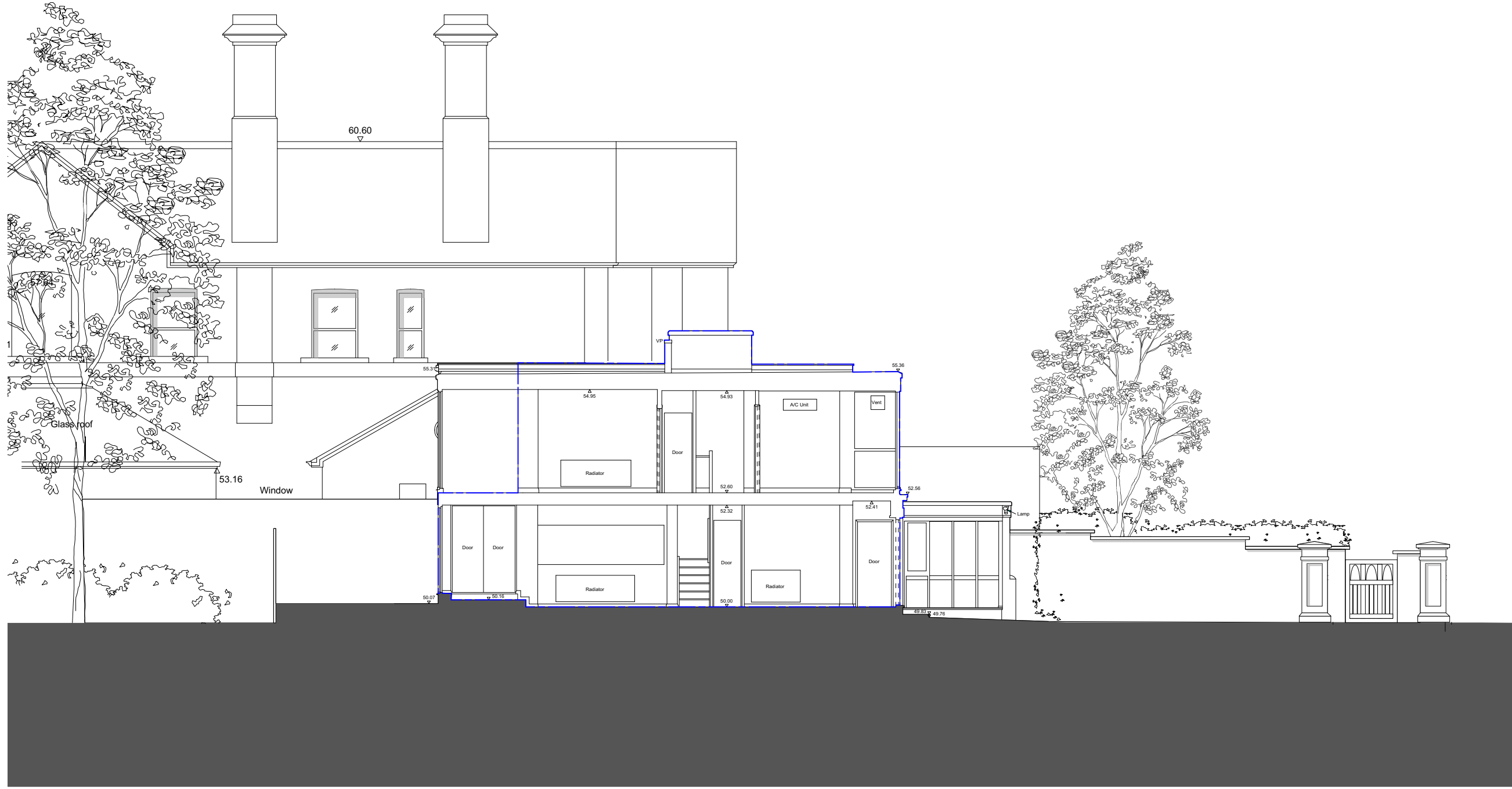
1 Proposed Section AA 1:100