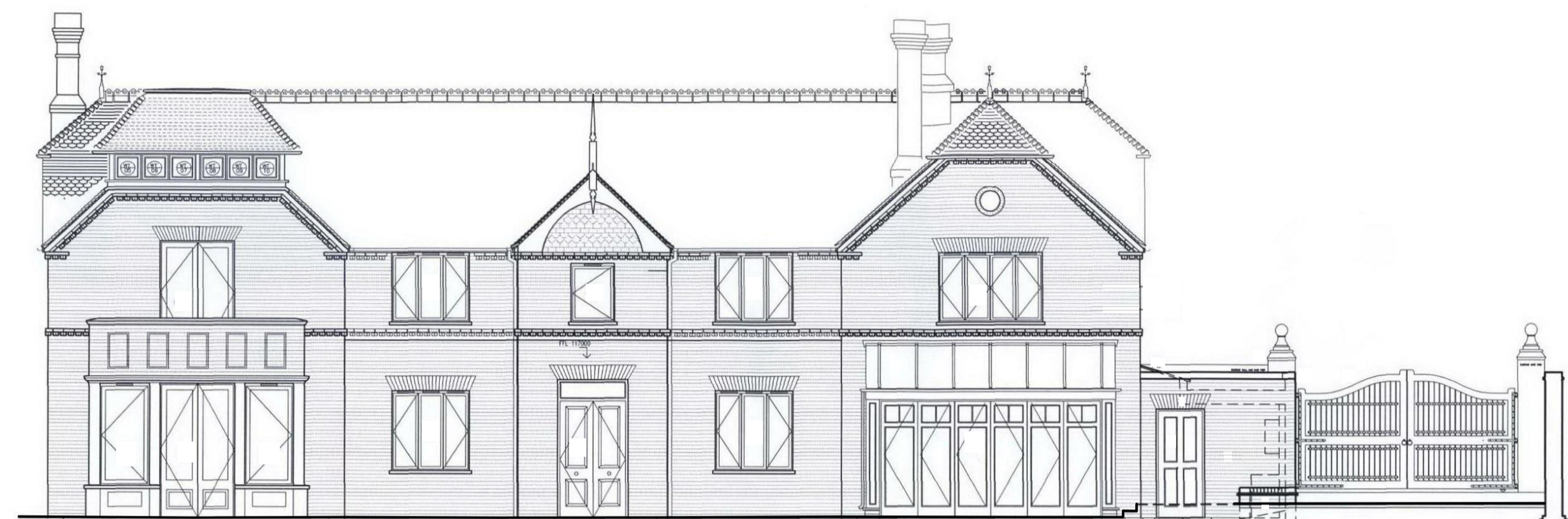
SCALE 1:100 @ A1, 1:200 @ A3 SOUTH ELEVATION - EXISTING