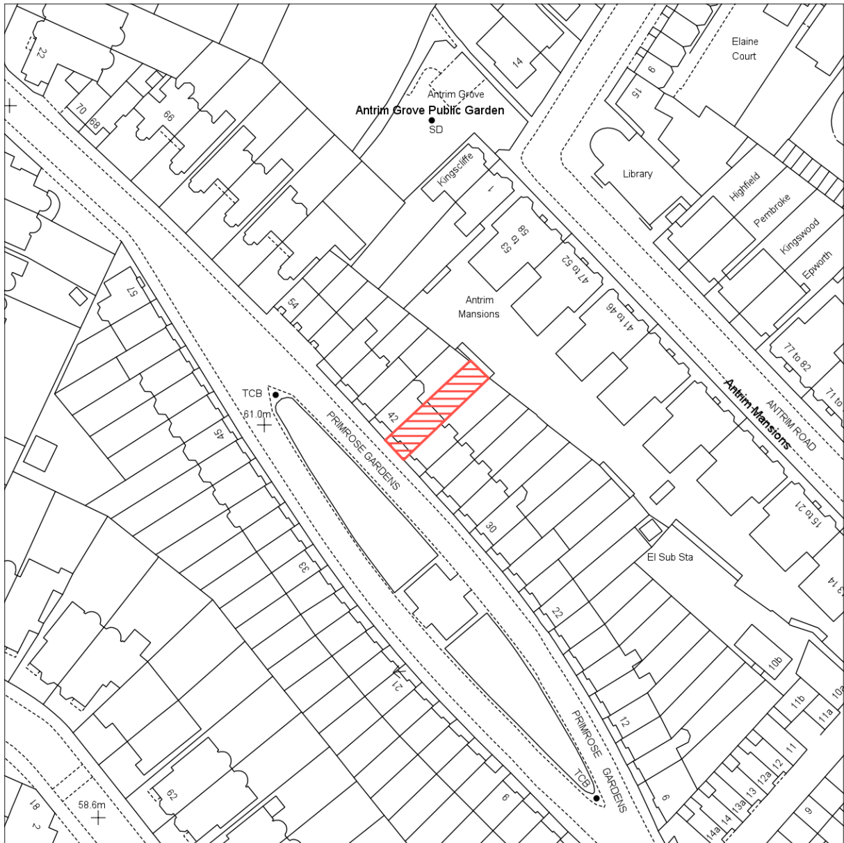
Location Plan-40 Primrose Gardens, London