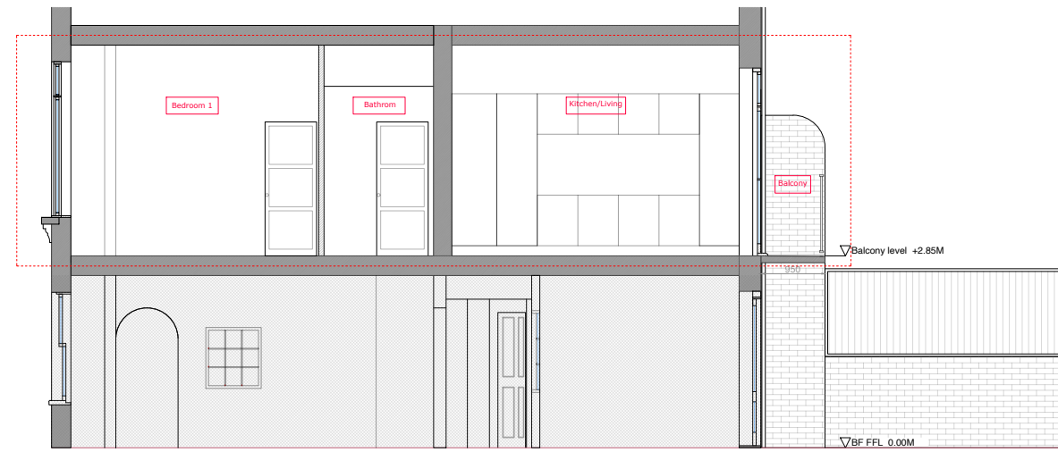
EXISTING SECTION A-A