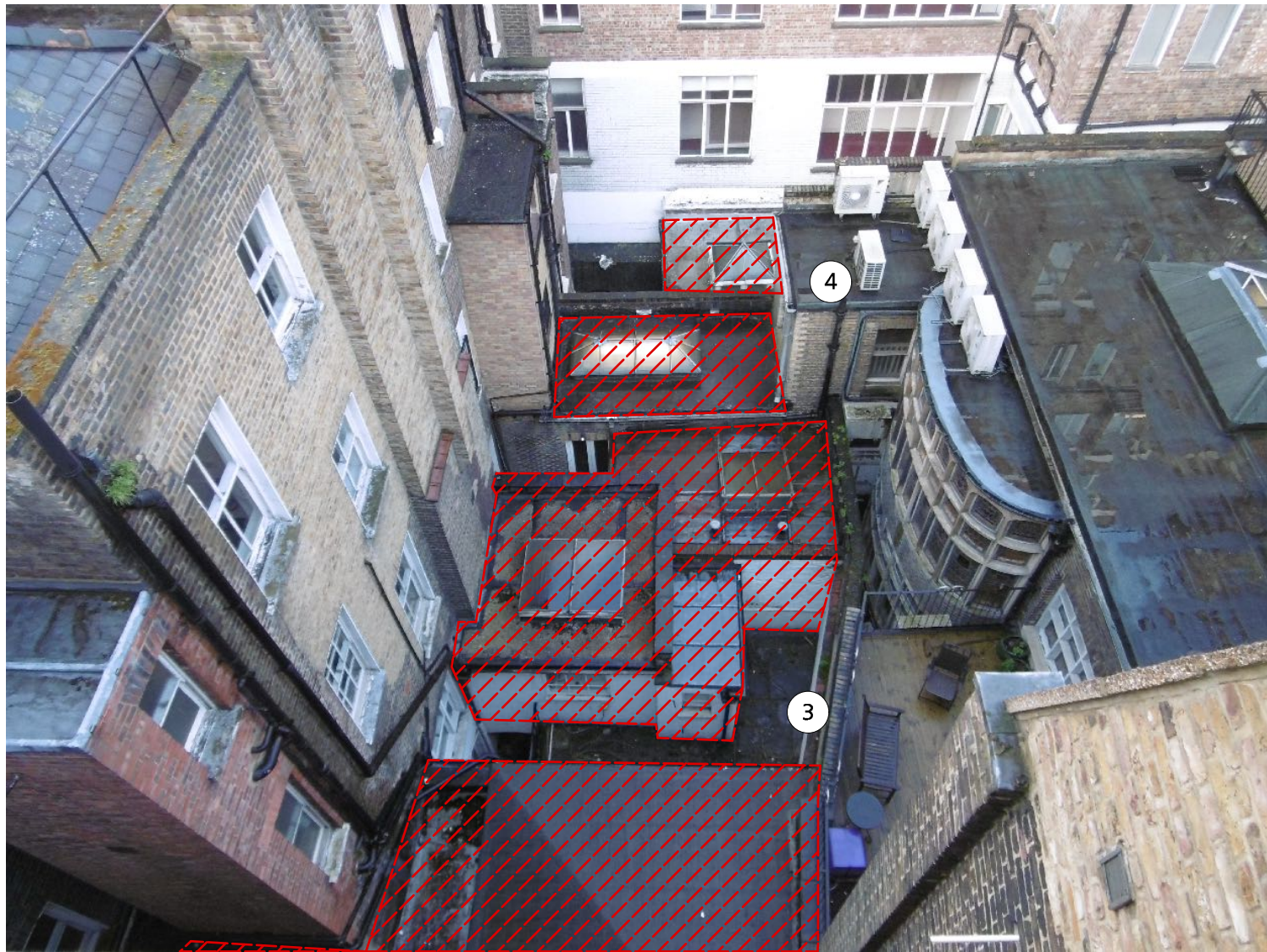
Non-original rear extensions to 46-48 Bedford Row Photograph from neighbouring property