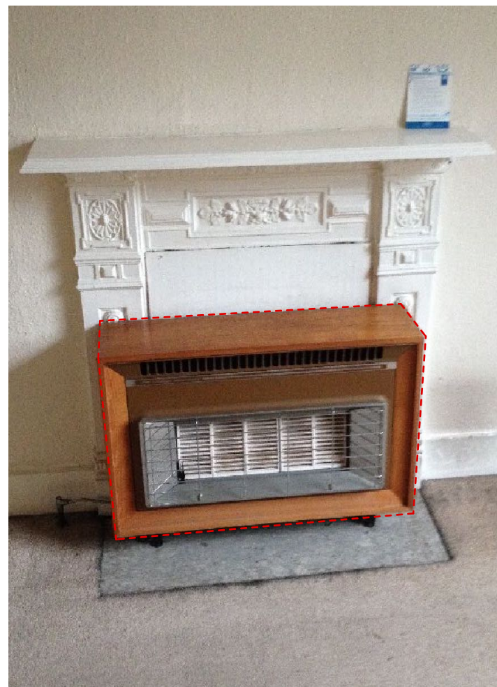
6 Room 48_3_04