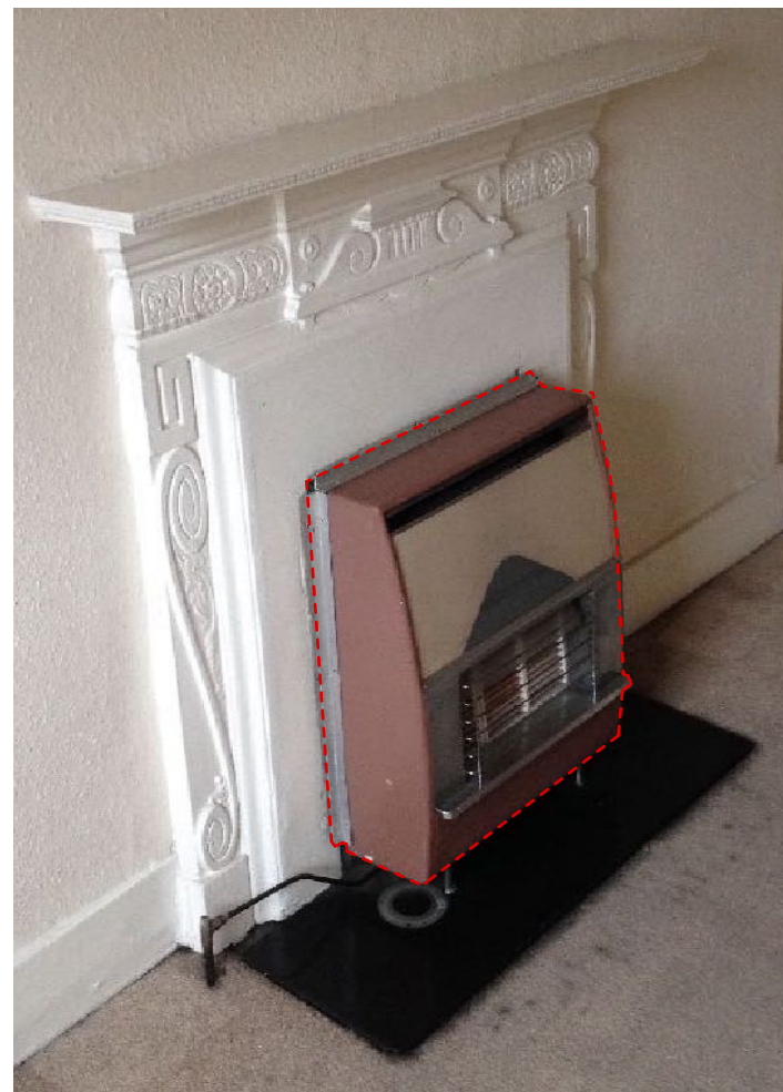
2 Room 48_3_03