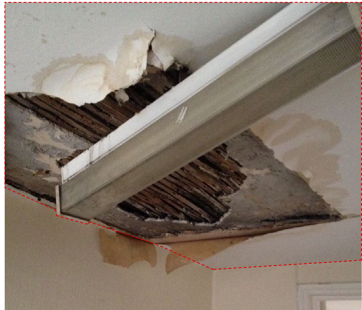
4 Room 48_3_01