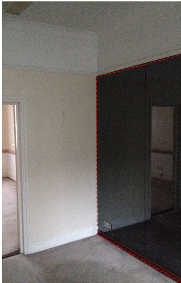
5 Room 48_G_03