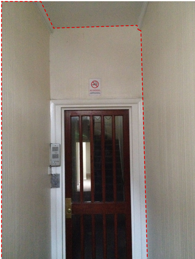
2 Room 48_G_08