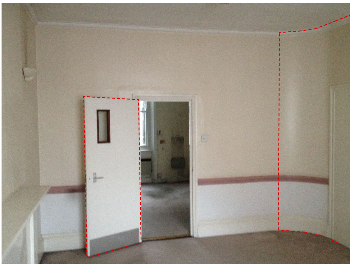
13 Room 48_G_02