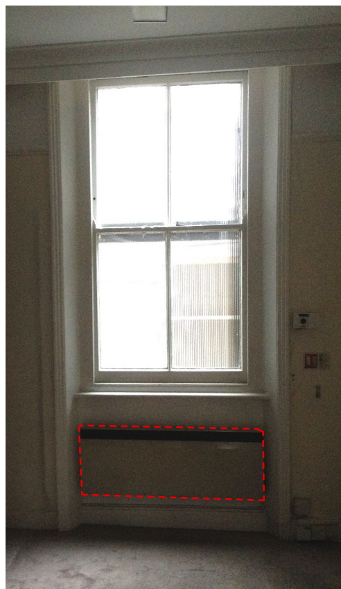
14 Room 48_G_03

All dimensions to be checked on site prior to commencement of any works, and/or preparation of any shop drawings.