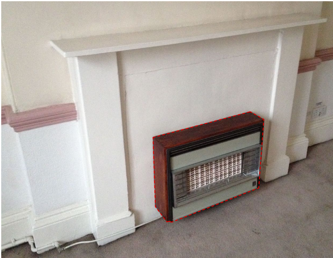
4 Room 48_G_02