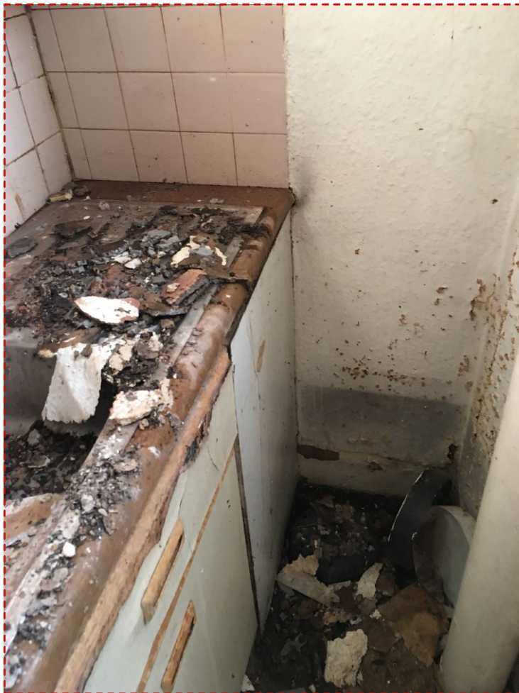
7 Room 48_G_05