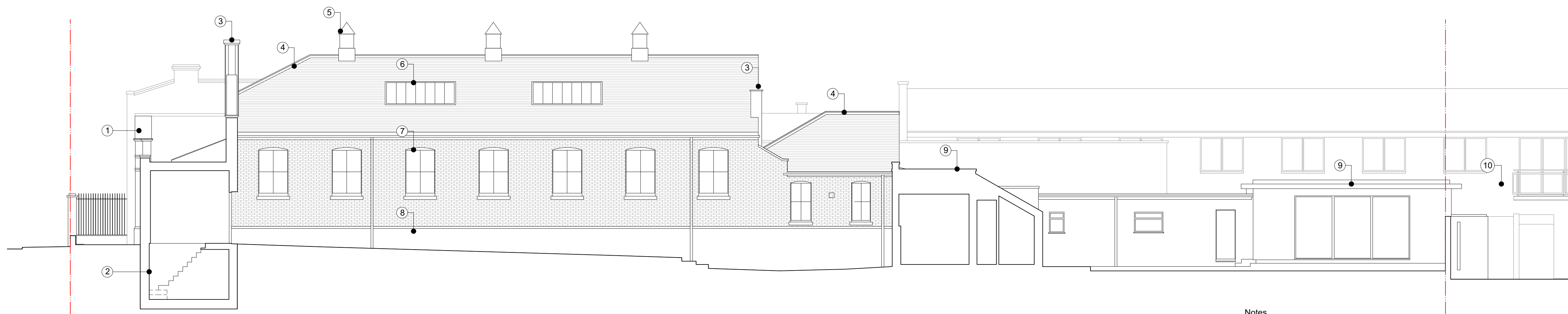
1 Section E 1:100 @ A1 / 1:200 @ A3