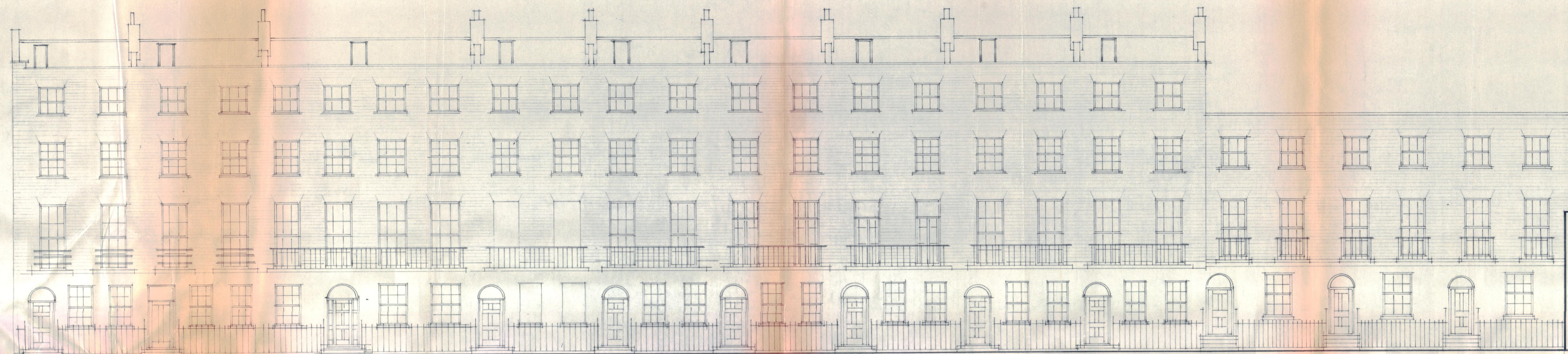
TERRACE 18 - 34 (EAST)