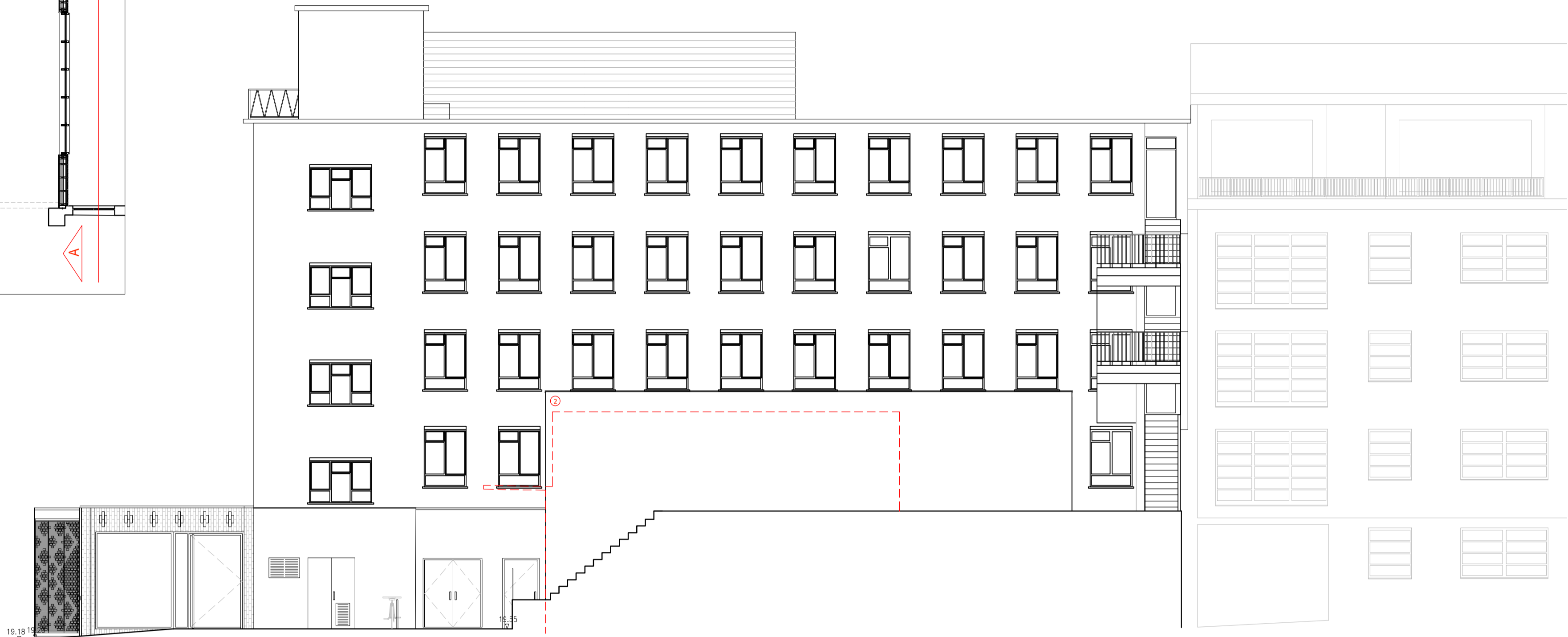
2 B-B ELEVATION 1:100 @ A1