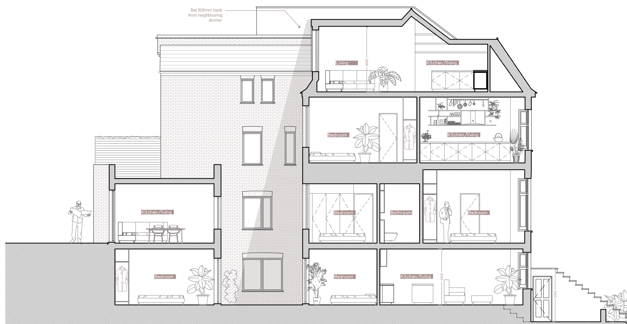
Proposed Section AA - 1:100@A3