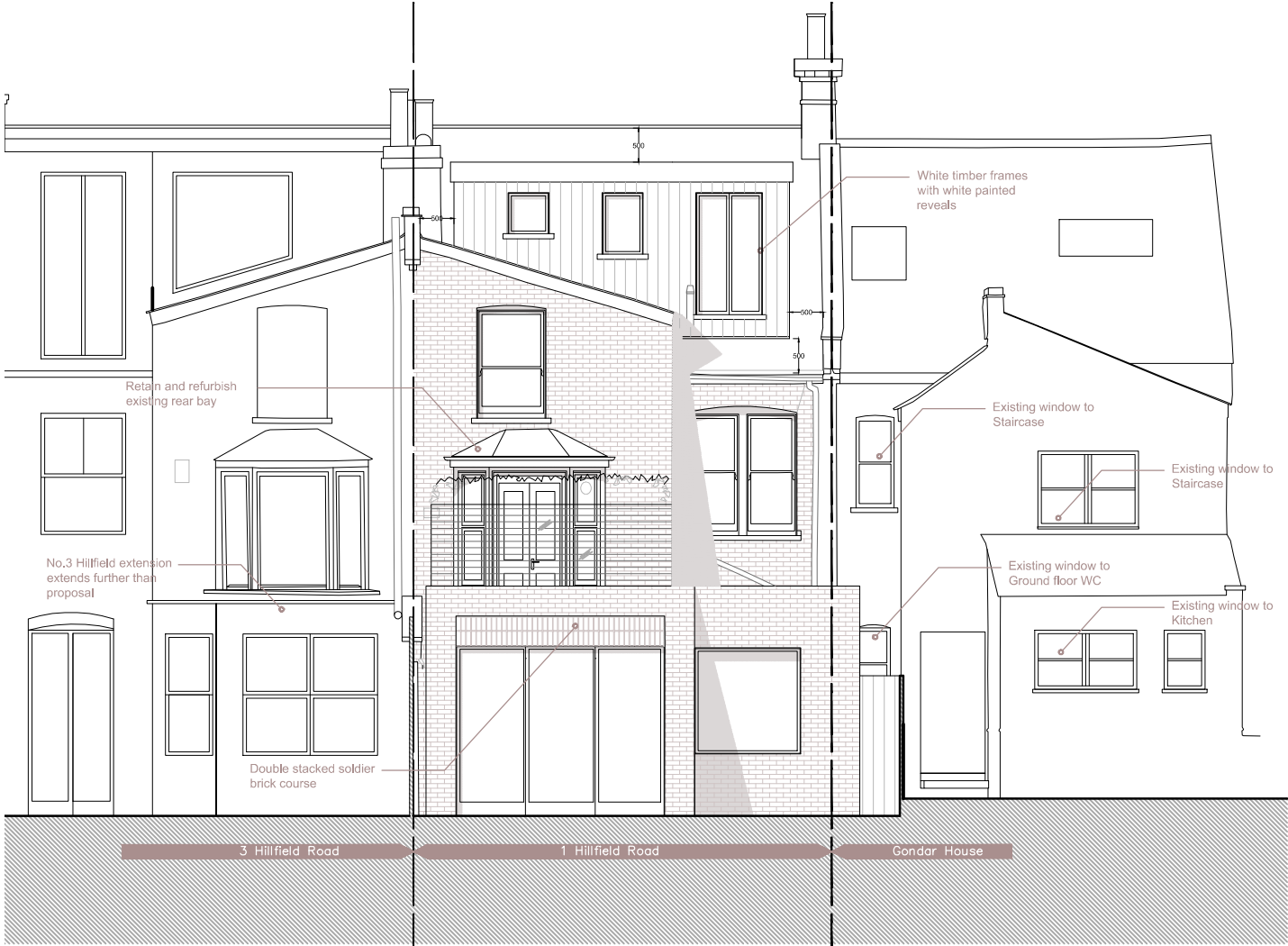
Proposed Rear Elevation - 1:100@A3