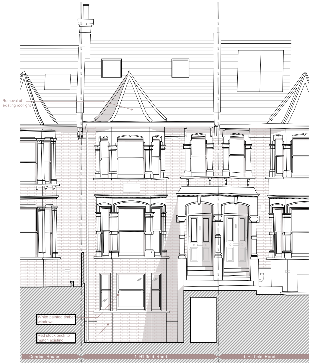
Proposed Front Elevation - 1:100@A3

All plans, sections & elevations are based on measured readings and any scaled dimension should not be relied upon to give an accurate measurement.