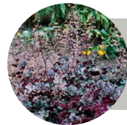
Heuchera "Purple Petticoats"