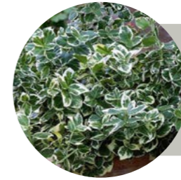
Euonymus "Emerald Gaiety"