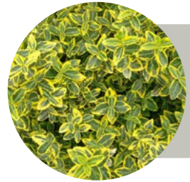
Euonymus "Emerald n Gold"