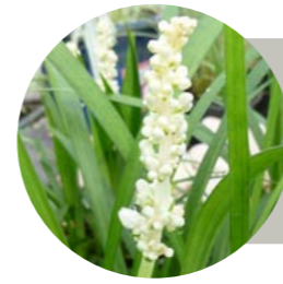
Liriope muscari "Monroe White"