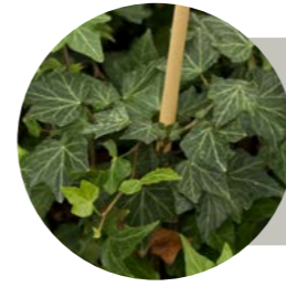
Hedera helix "Green Ripple"