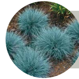
Festuca glauca "Elijah Blue"