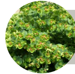
Euphorbia "Mini Martini"