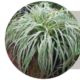
Carex "Silver Sceptre"