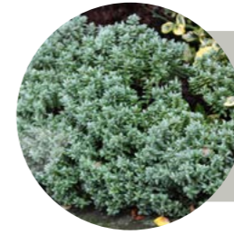
Hebe pinguifolia "Pagei"