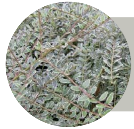
Lonicera "Silver Beauty"