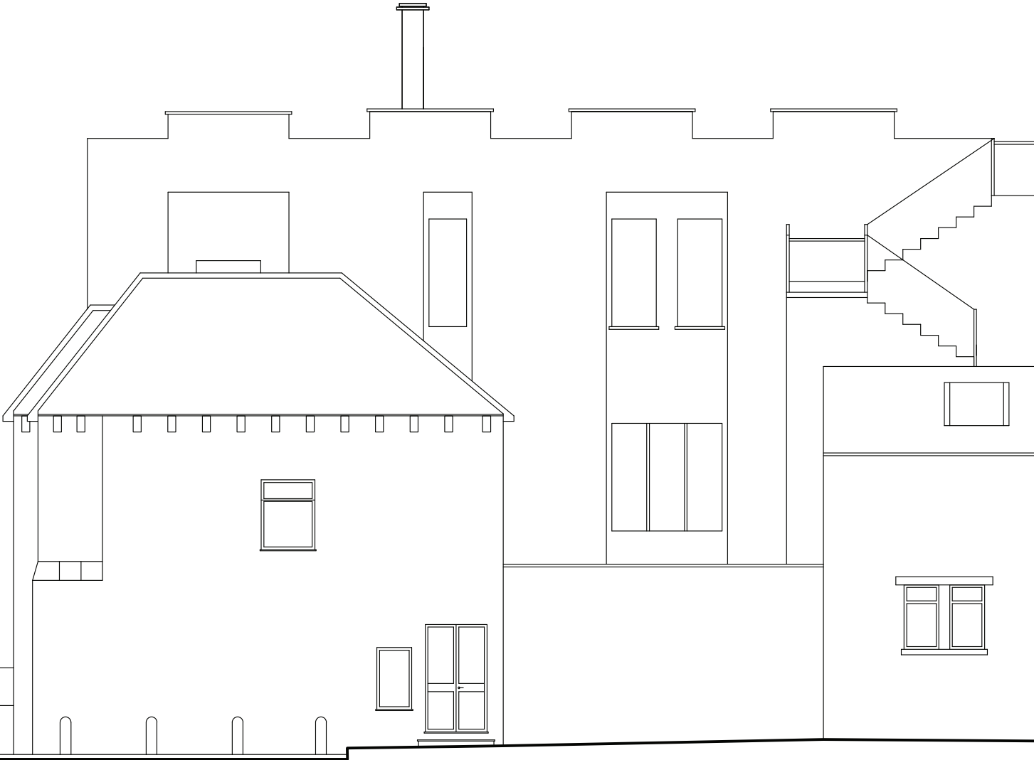
EXISTING EAST ELEVATION 1:100

Notes: Any discrepancies on this drawing with other documents to be reported immediately to the Contract Administrator for clarification