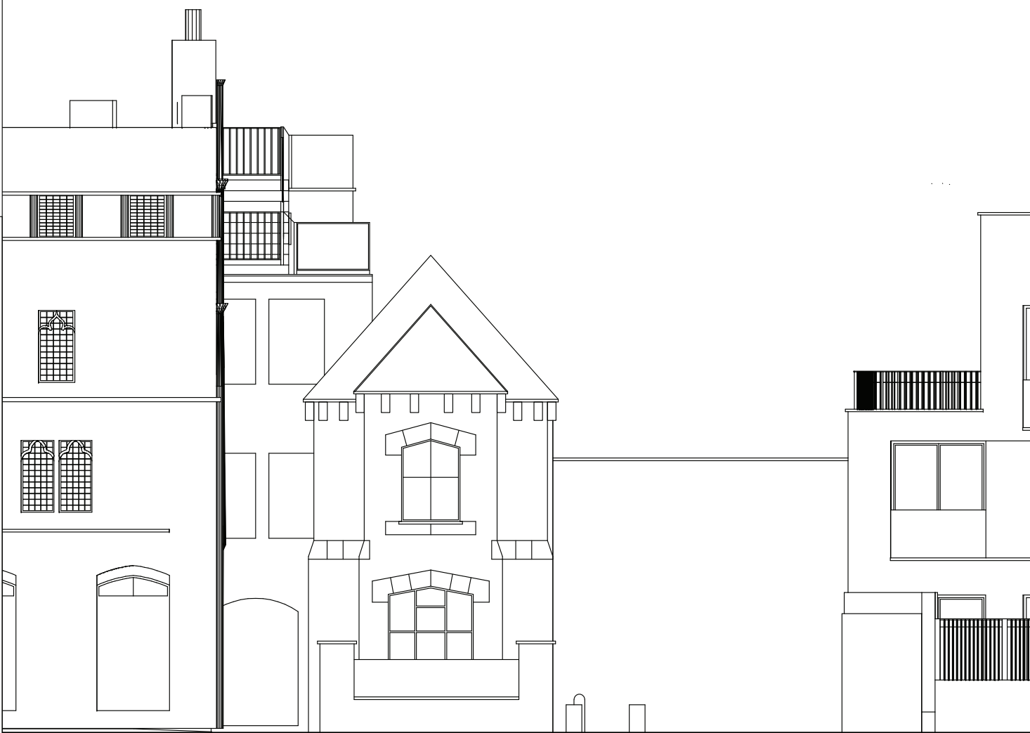
EXISTING SOUTH ELEVATION 1:100

Notes: Any discrepancies on this drawing with other documents to be reported immediately to the Contract Administrator for clarification