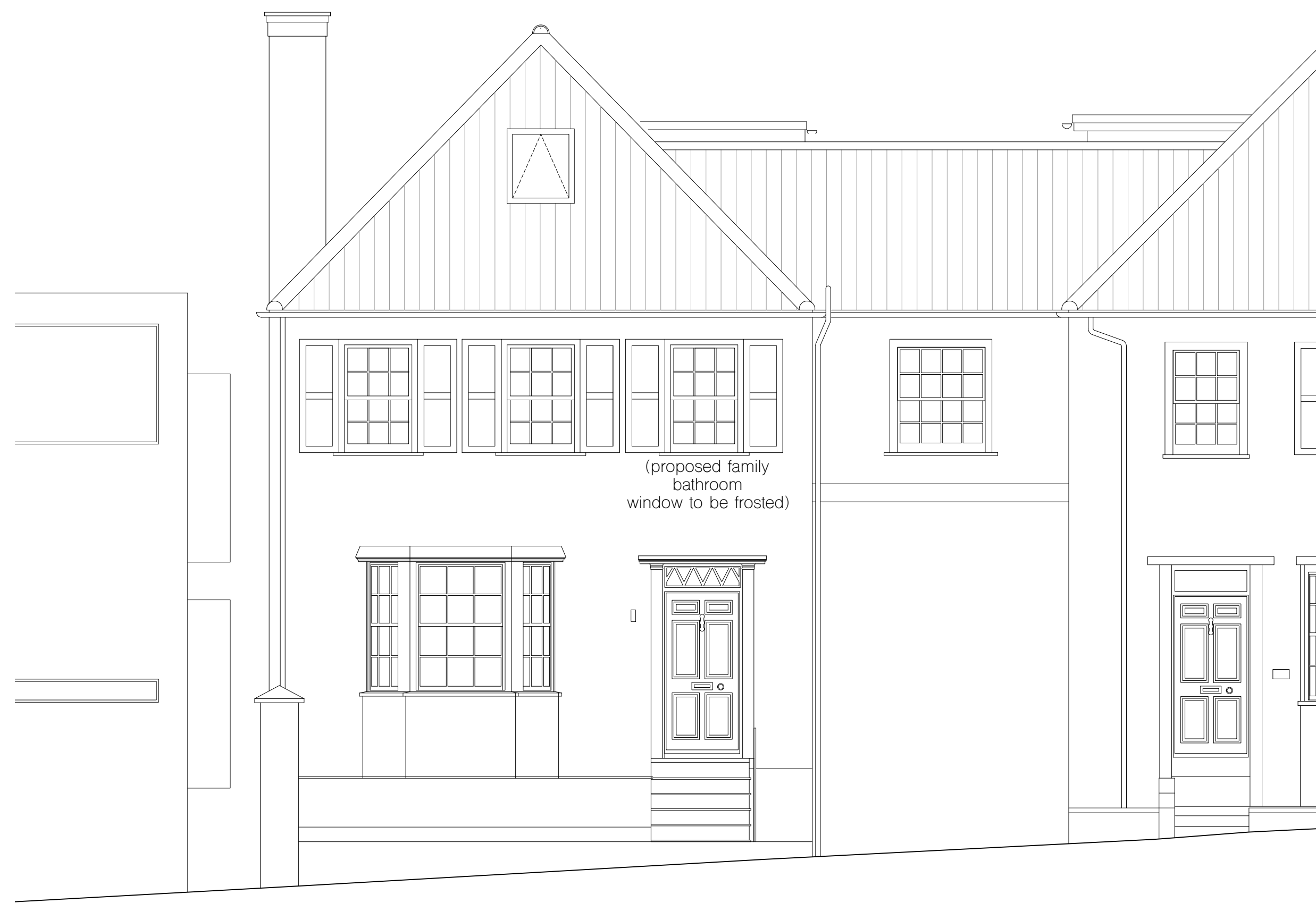
1 north/ front elevation