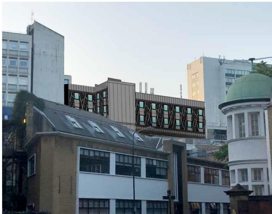
Proposed view from Burton Street in Bloomsbury Conservation Area