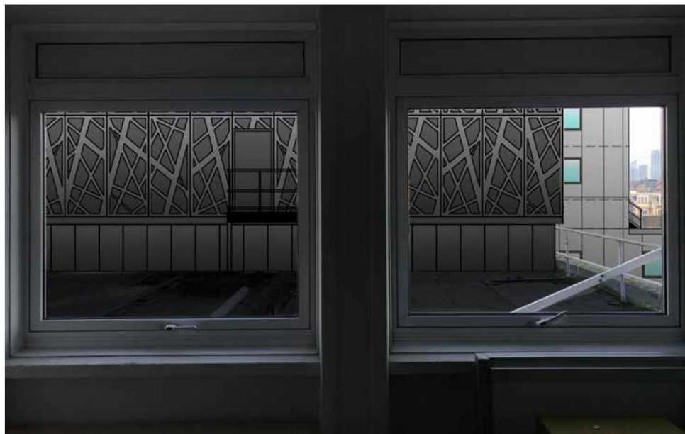
Proposed view from a habitable room in Somerton House