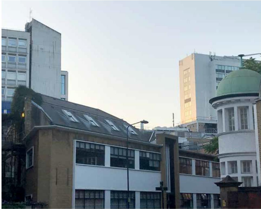
Existing view from Burton Street in Bloomsbury Conservation Area