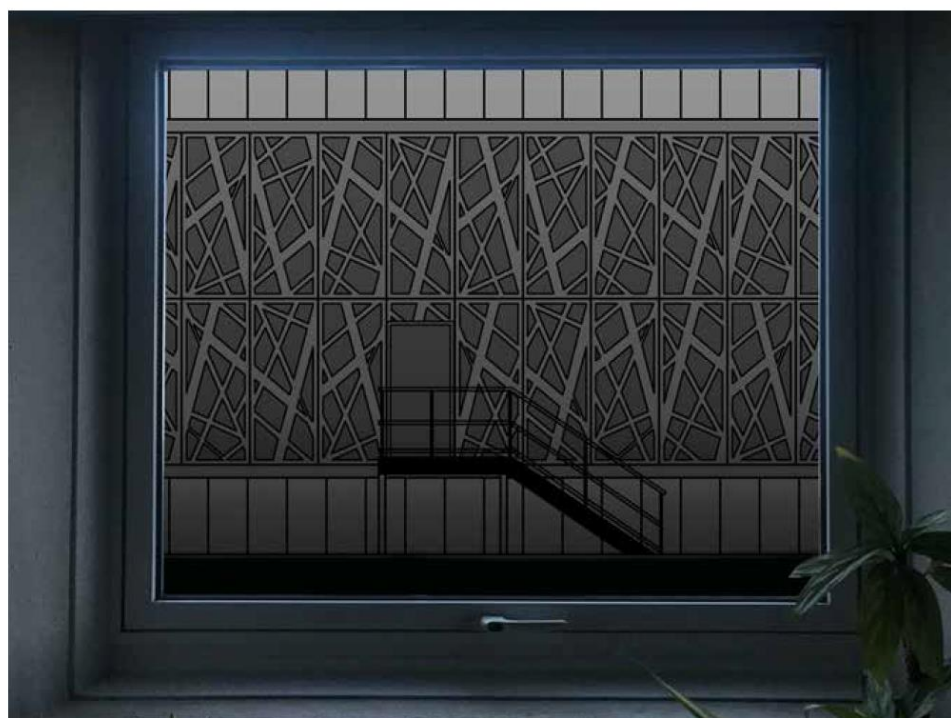
Proposed view from a habitable room in Somerton House