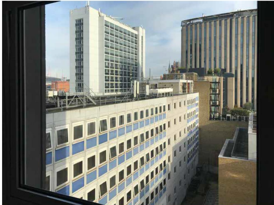
Existing view from a habitable room in Somerton House

levels of outlook and natural light to unacceptable levels for the neighbouring residents at Somerton House. Furthermore, the images show that the sense of enclosure would also increase unacceptably for the neighbouring residents.