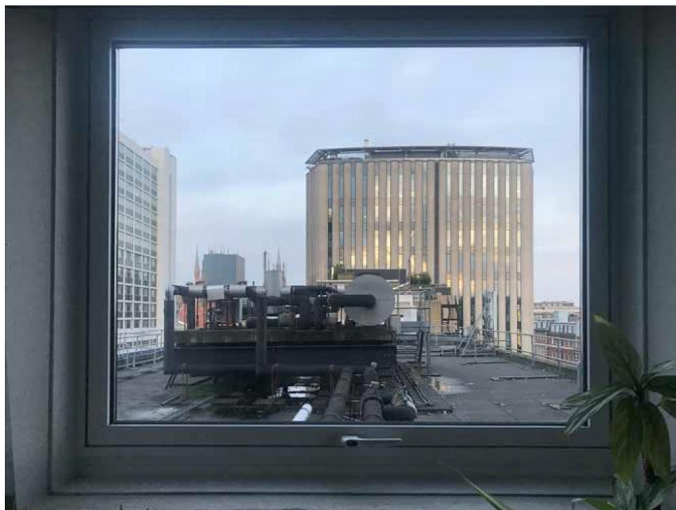
Existing view from a habitable room in Somerton House