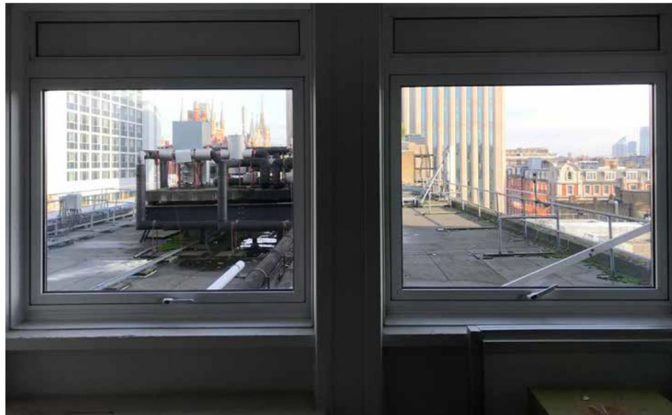
Existing view from a habitable room in Somerton House