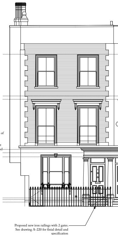
PROPOSED FRONT ELEVATION FROM STREET

Replacement cast iron spindles and flat handrail to be painted black