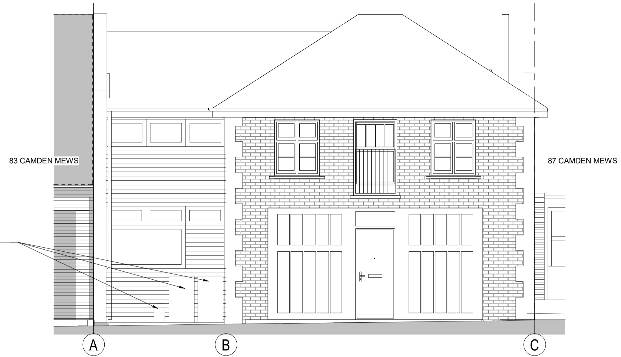
2 PROPOSED Front Elevation - Waste Storage Location 1230 1 : 50

Location of proposed external waste storage is convenient for removal.