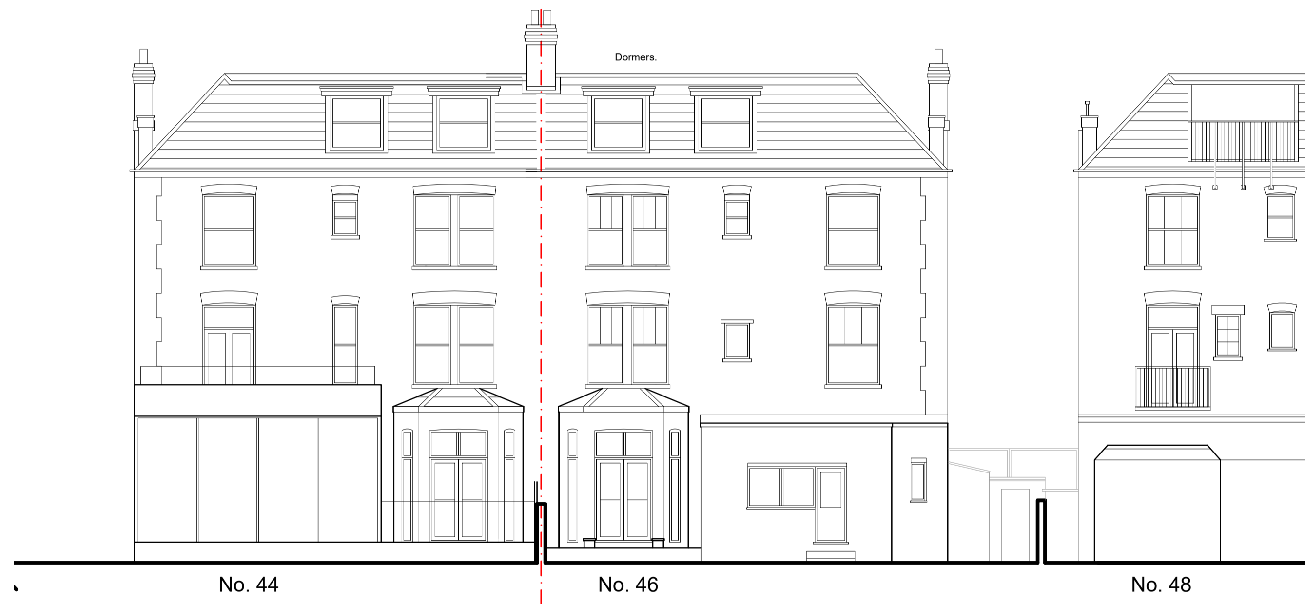
Proposed Front Elevation (unchanged) SCALE 1:100