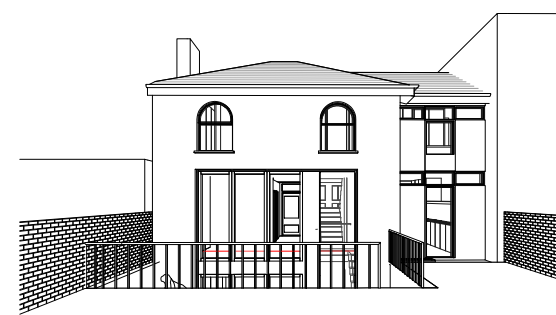
C Perspective View from Garden _P30