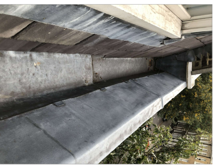
Photograph 2: Existing front elevation box gutter where proposed overflow pipes will penetrate.