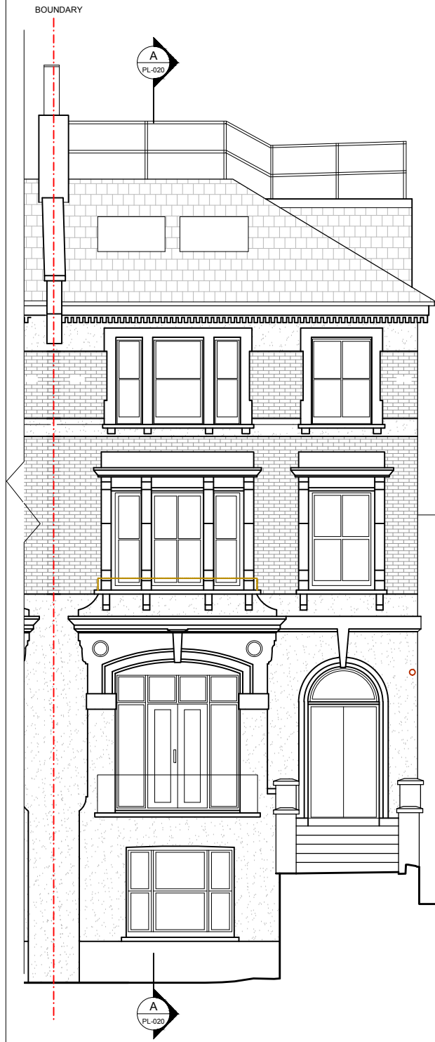
EXISTING FRONT ELEVATION SCALE 1:100 @ A3