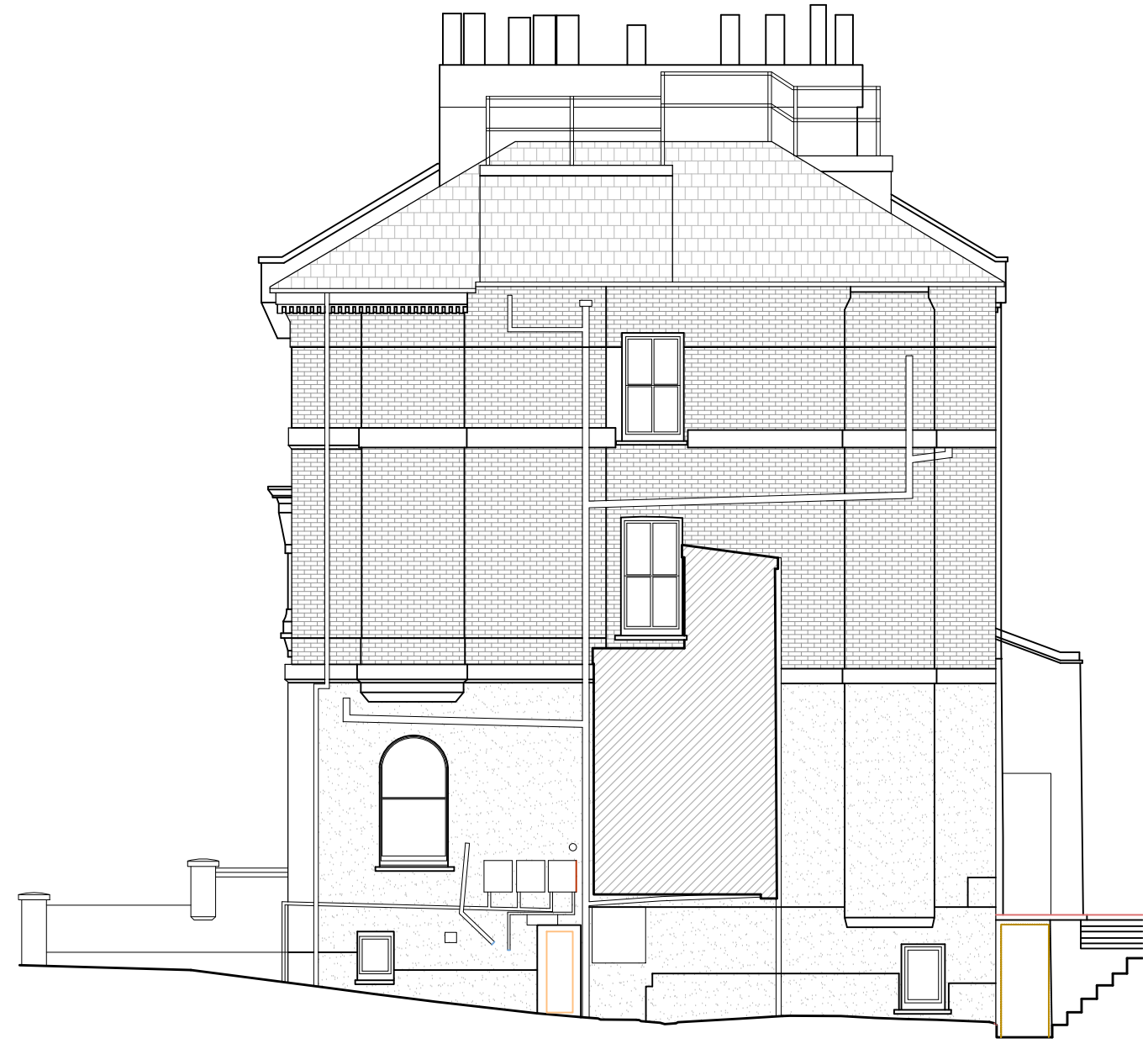
EXISTING SIDE ELEVATION SCALE 1:100 @ A3