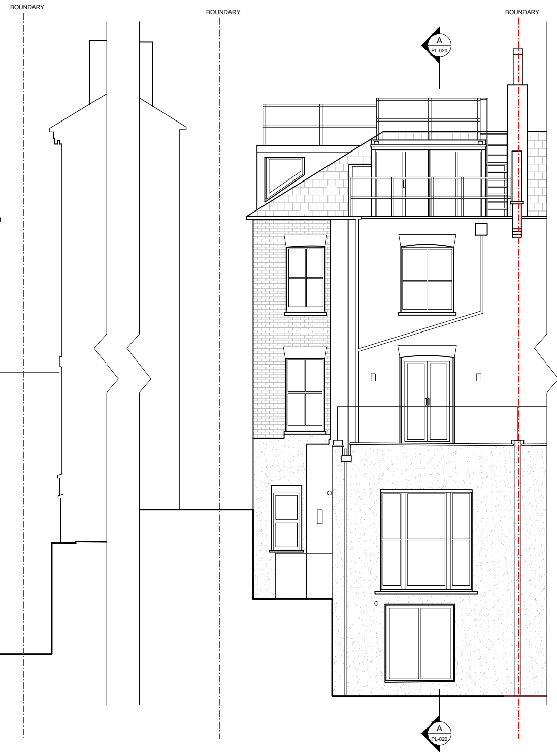
EXISTING REAR ELEVATION SCALE 1:100 @ A3