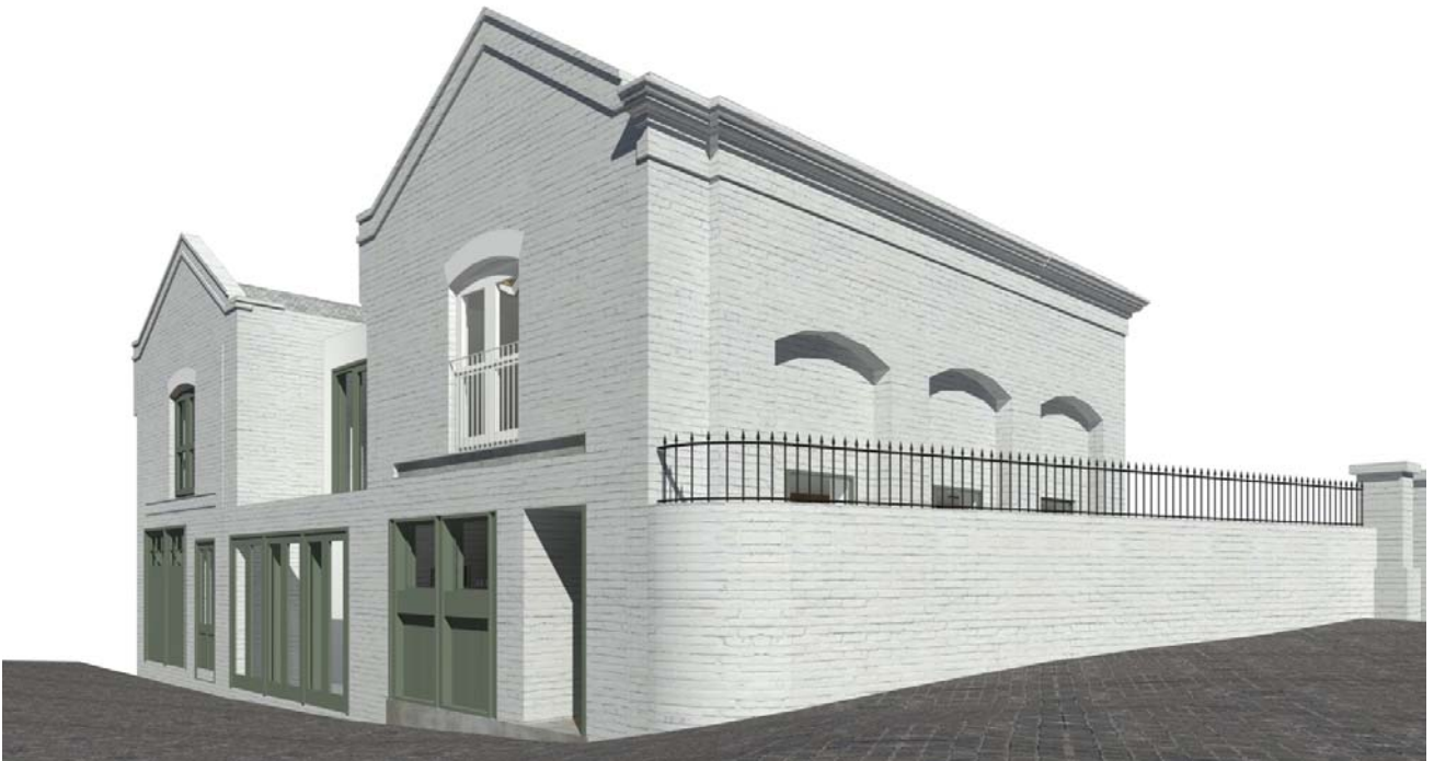
Proposed View from Primrose Gardens