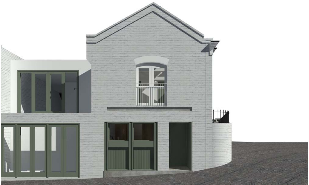
Proposed Side View