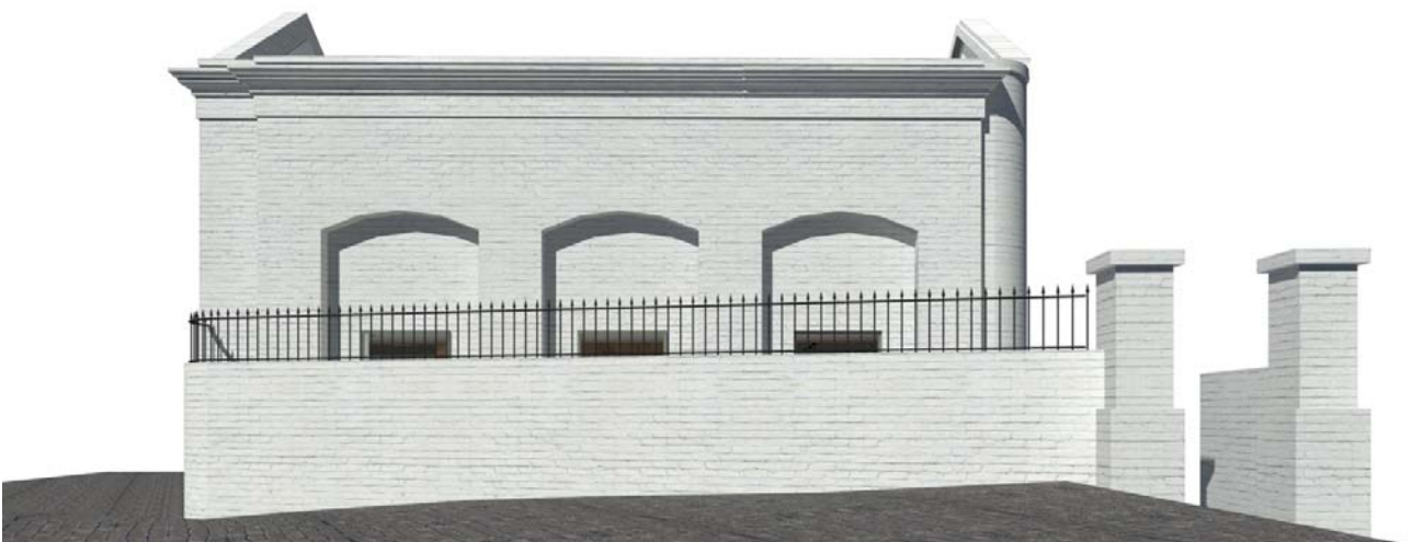
View of the internal courtyard.