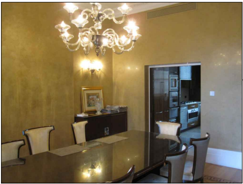
Proposed opening with sliding doors to be as approved / existing at 33 Chester Terrace

Note All existing windows, skirting boards and staircase handrails to be retained and painted if necessary. All the cornices in the building to be replaced and installed ditto to the cornices installed at 33 Chester Terrace.