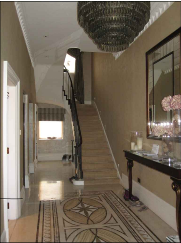
Entrance Hall to incorporate similar design features, such as floor tiles and stair lights as already existing in 33 Chester Terrace