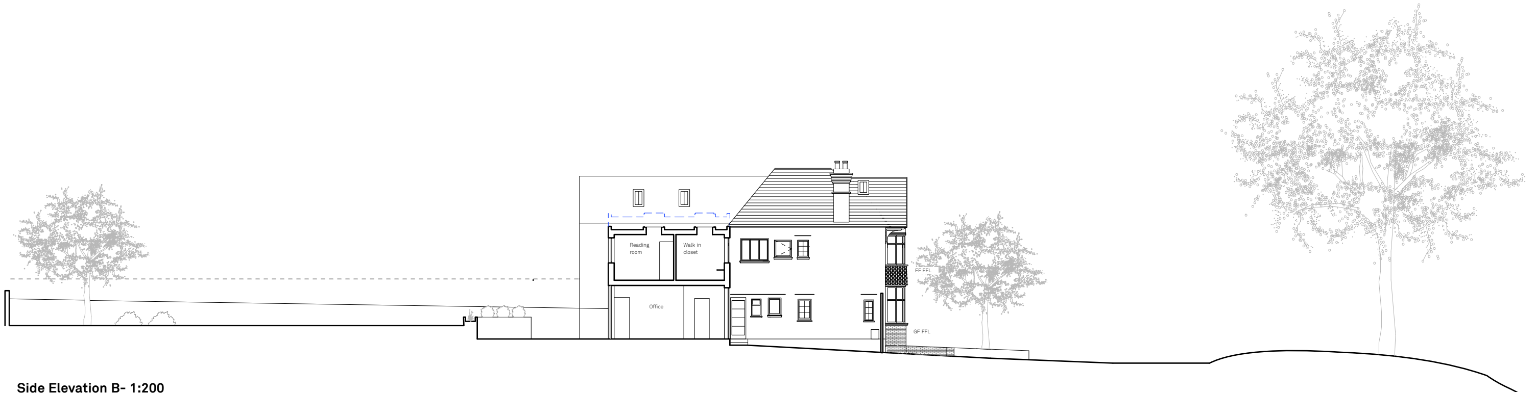
Side Elevation B- 1:200