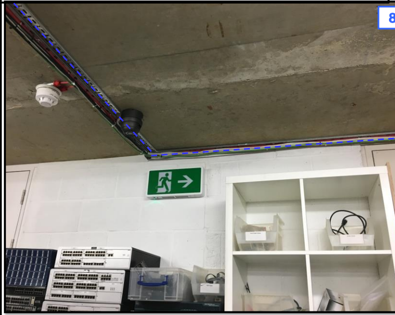
8. 12f cable to follow existing cable route on high level cable tray through basement store and towards comms room.