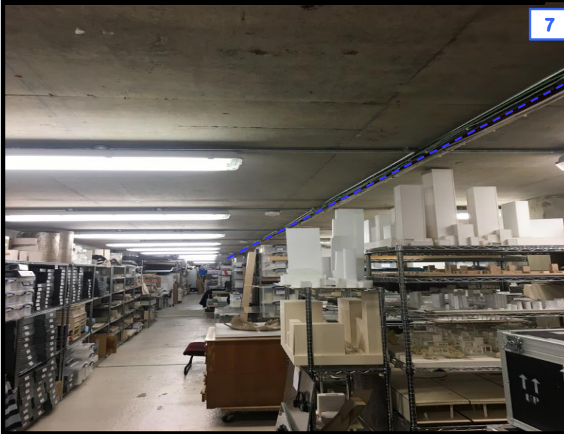
7. 12f cable to follow existing cable route on high level cable tray through basement store and towards comms room.