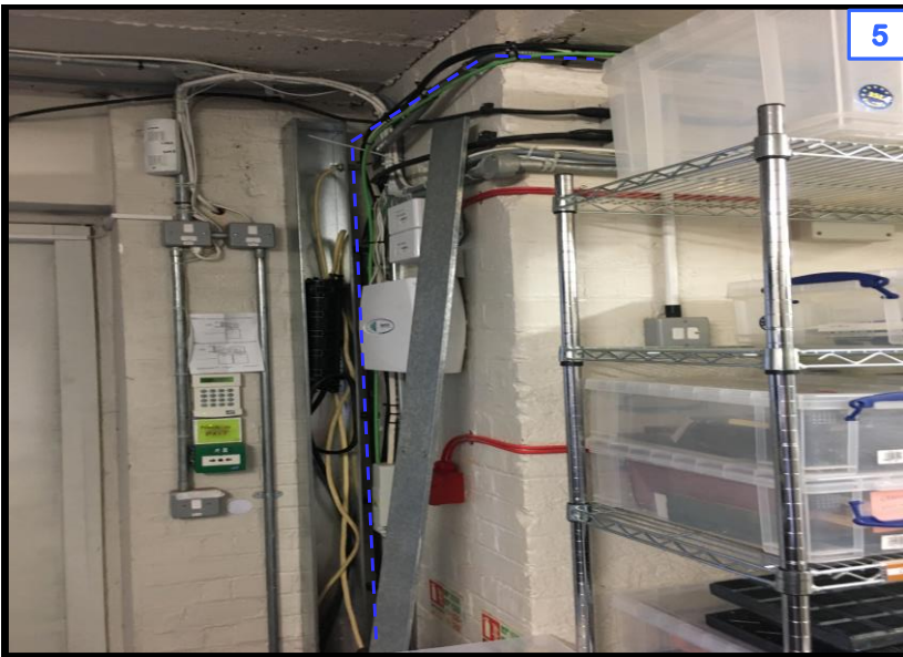
5. 12f cable to enter into basement store room via existing hole. 12f cable to follow existing cable route through basement store and towards comms room.