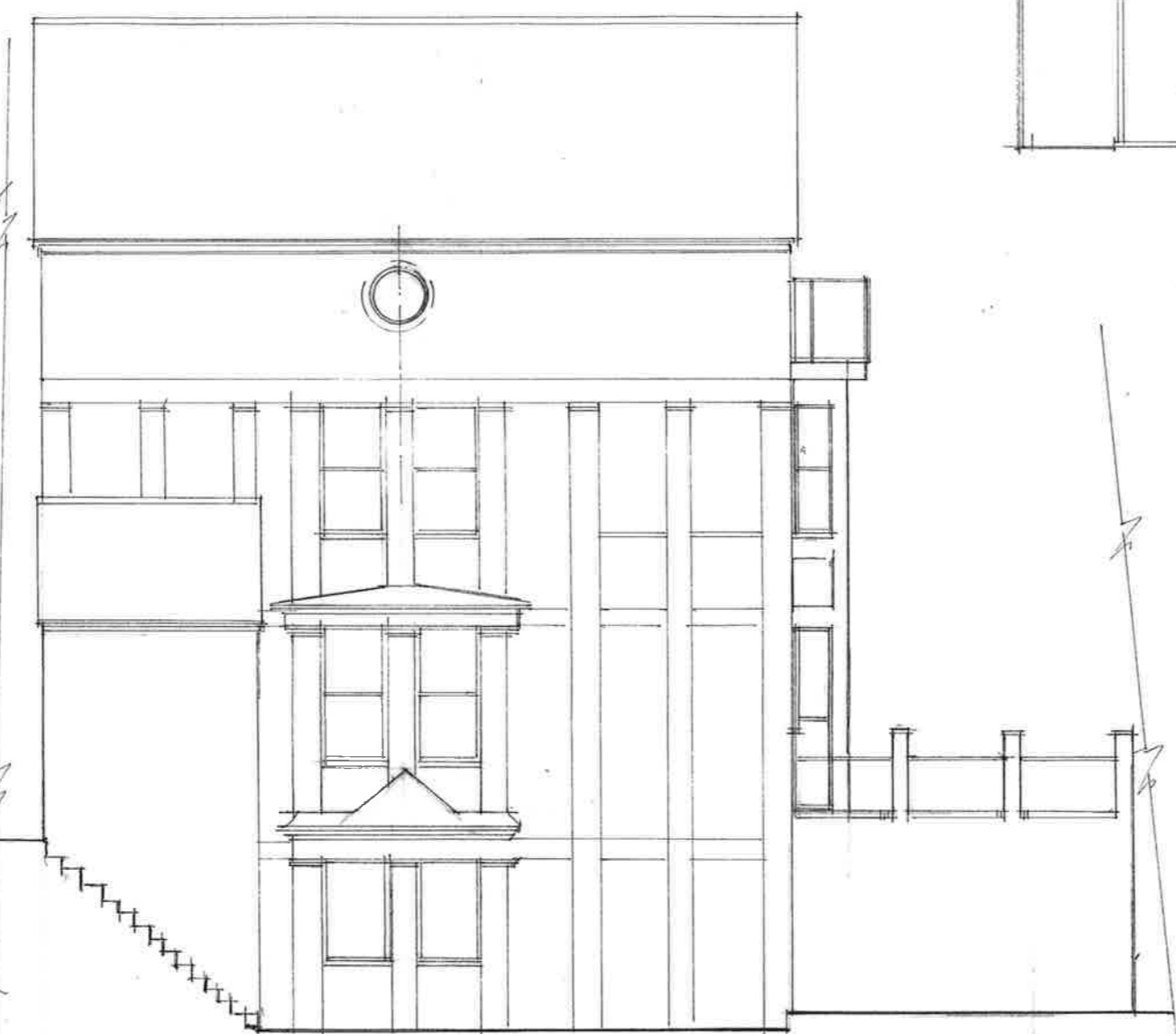
NORTH SIDE ELEVATION