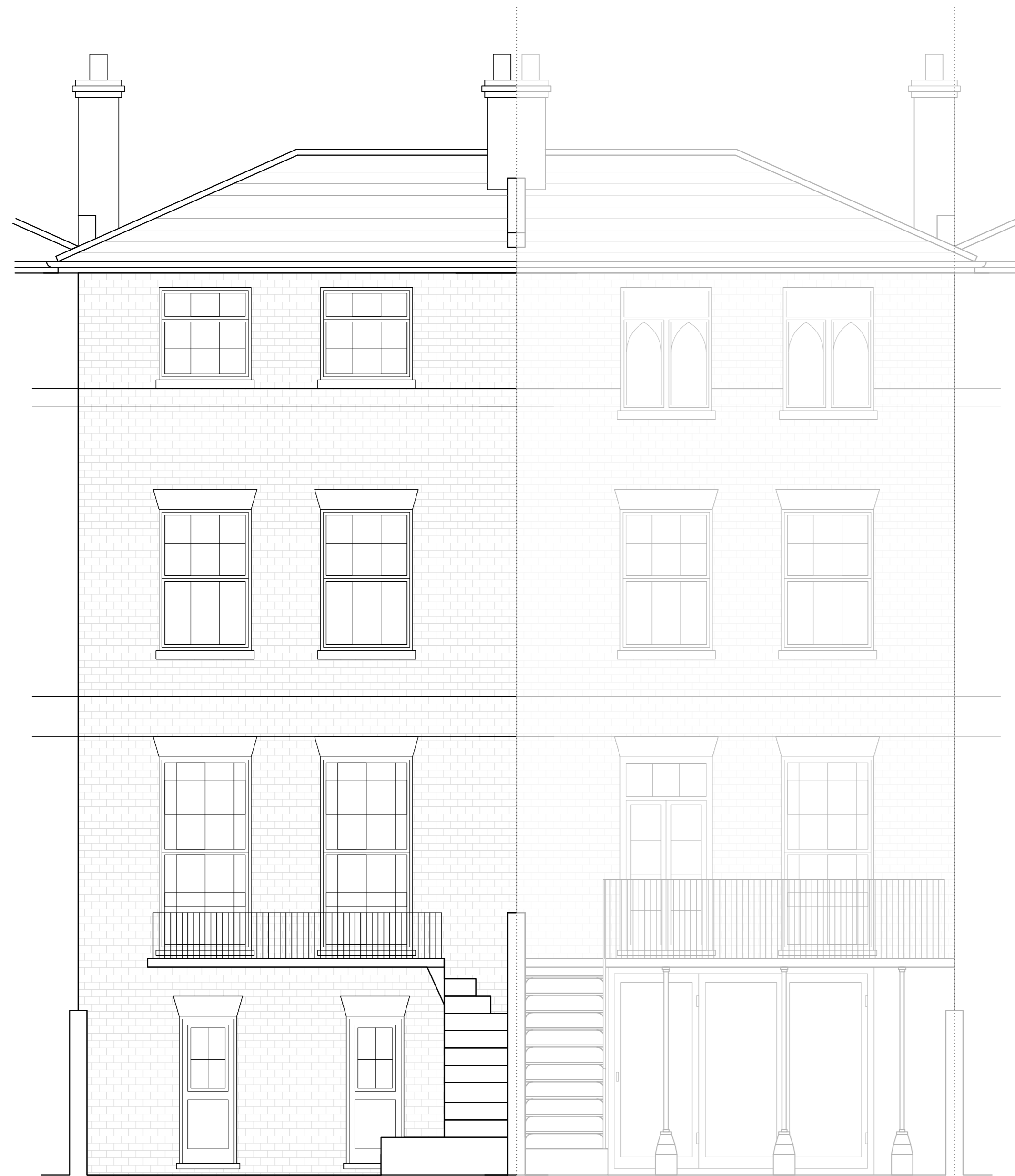
EXISTING REAR ELEVATION Scale: 1:50