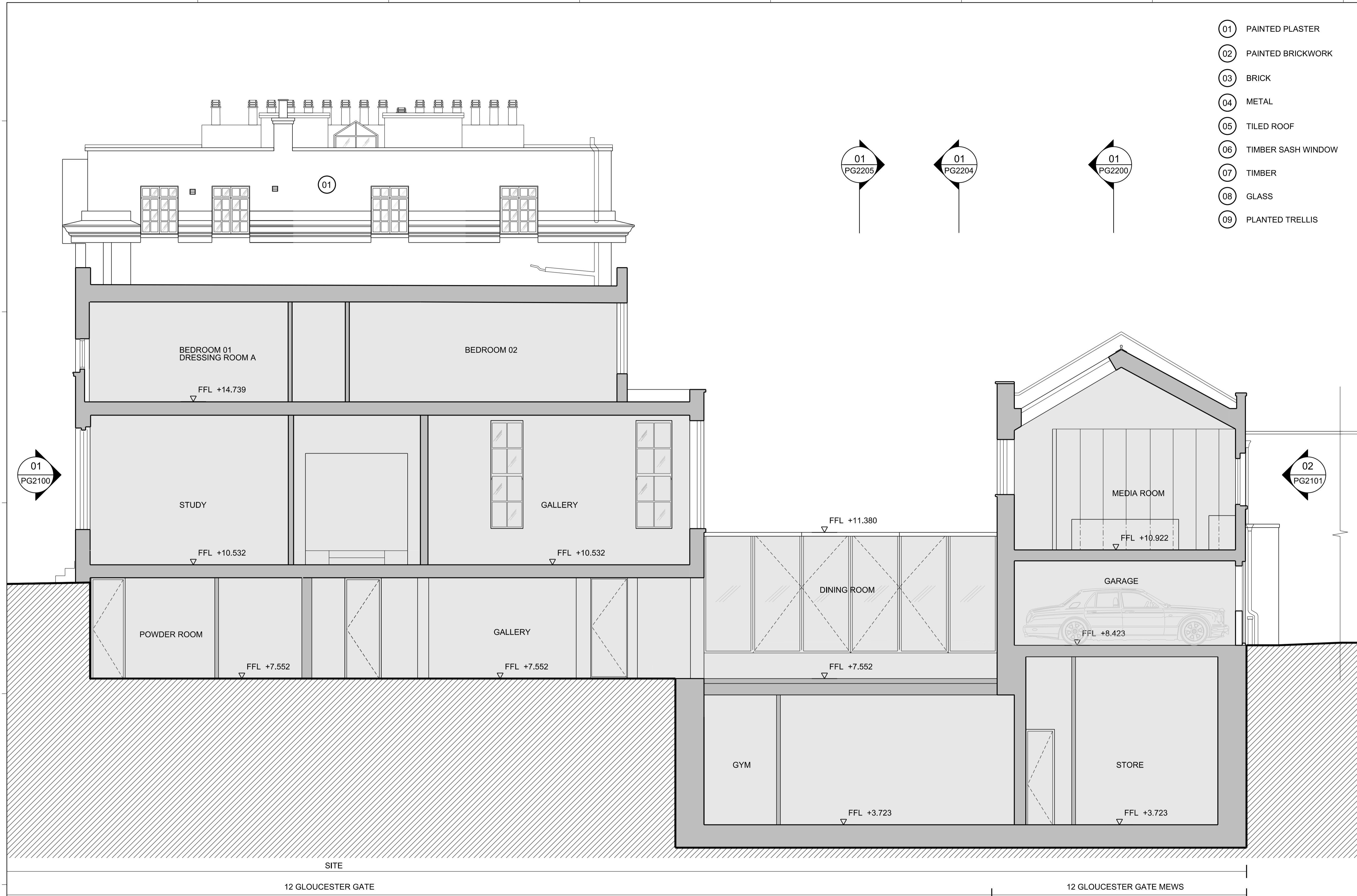
01 Proposed section A 1:50

Project No. Draw No. Rev No. 1202 PG2202 01