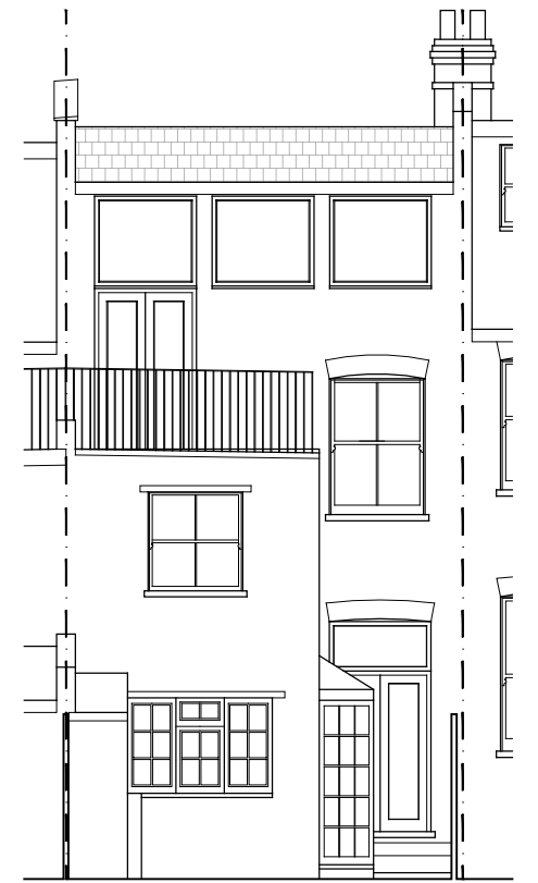
REAR ELEVATION (existing)