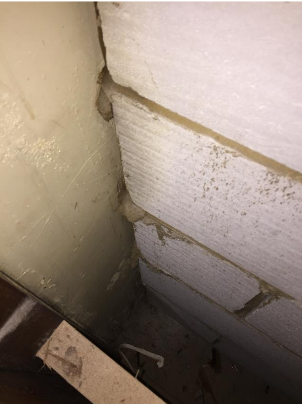
7. View behind sealed door and infill blockwork