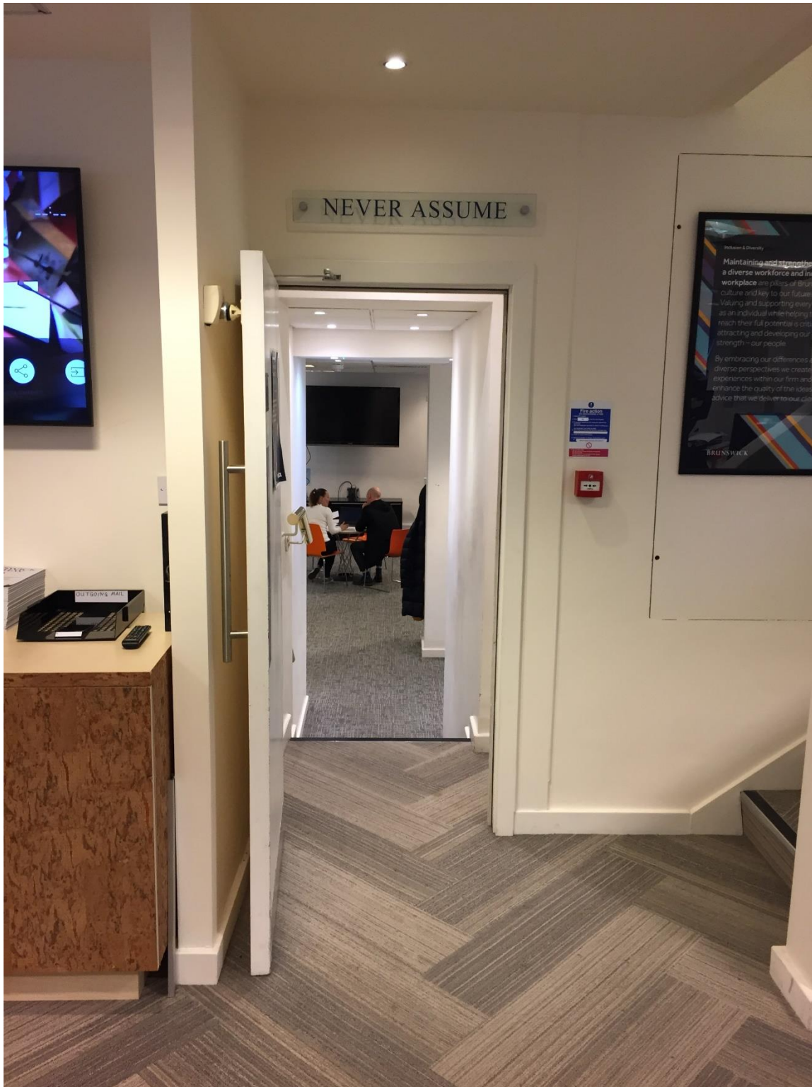
3. View of a similar opening through party wall from floor 4, 19 Lincoln's Inn Fields to floor 2, 20 Lincoln's Inn Fields. See photo 5 for opposite view.