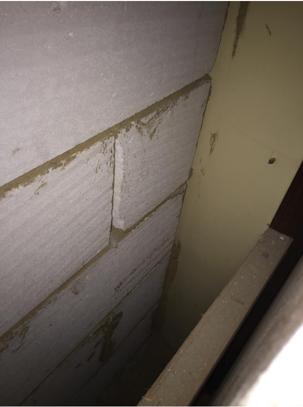
6. View behind sealed door and infill blockwork