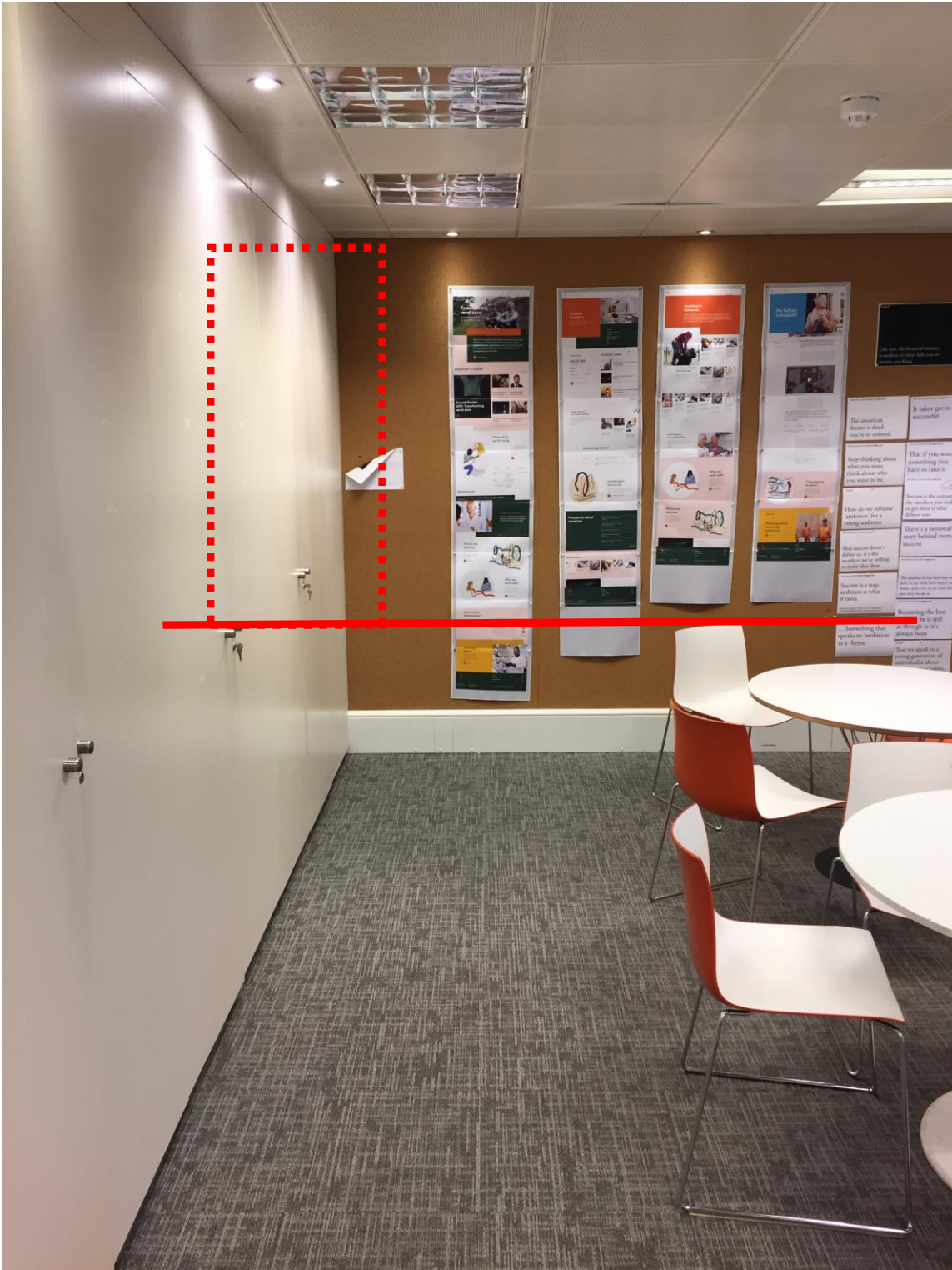
4. View of proposed door location from no. 20 Lincoln's Inn Fields. Proposed location marked out (dashed red), with indicative floor level of no. 19 (solid red)