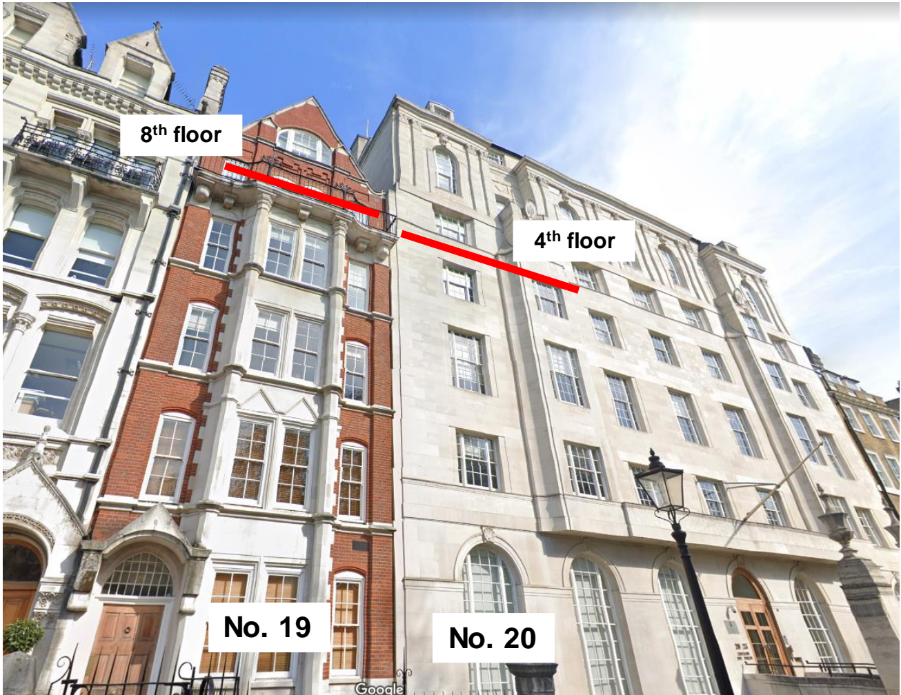
1. Front elevation of no. 19 & 20 Lincoln's Inn Fields. Indicative red line to demonstrate 8 th floor, no. 19 and 4 th floor, no. 20.