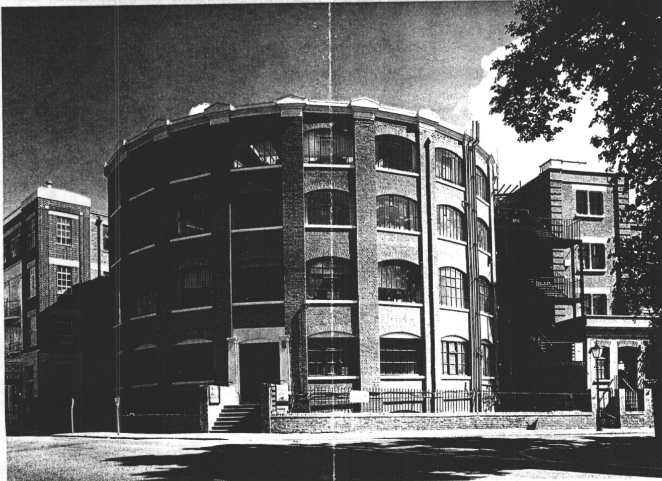
View from Oval Road