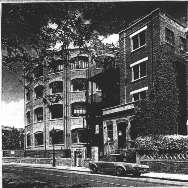
View from Gloucester Crescent