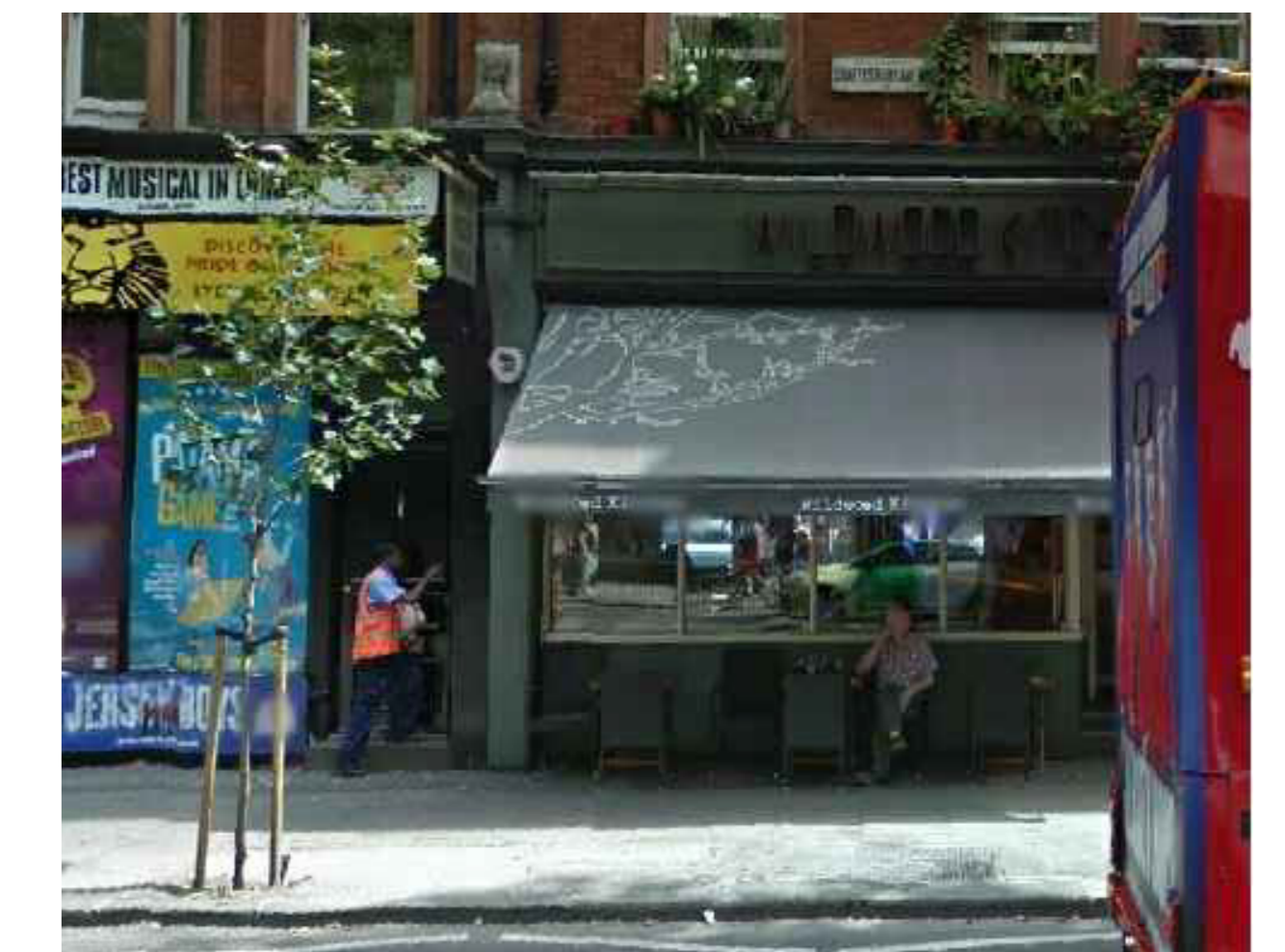
GOOGLE VIEW TREE TO LEFT SIDE OF WILDWOOD SITE